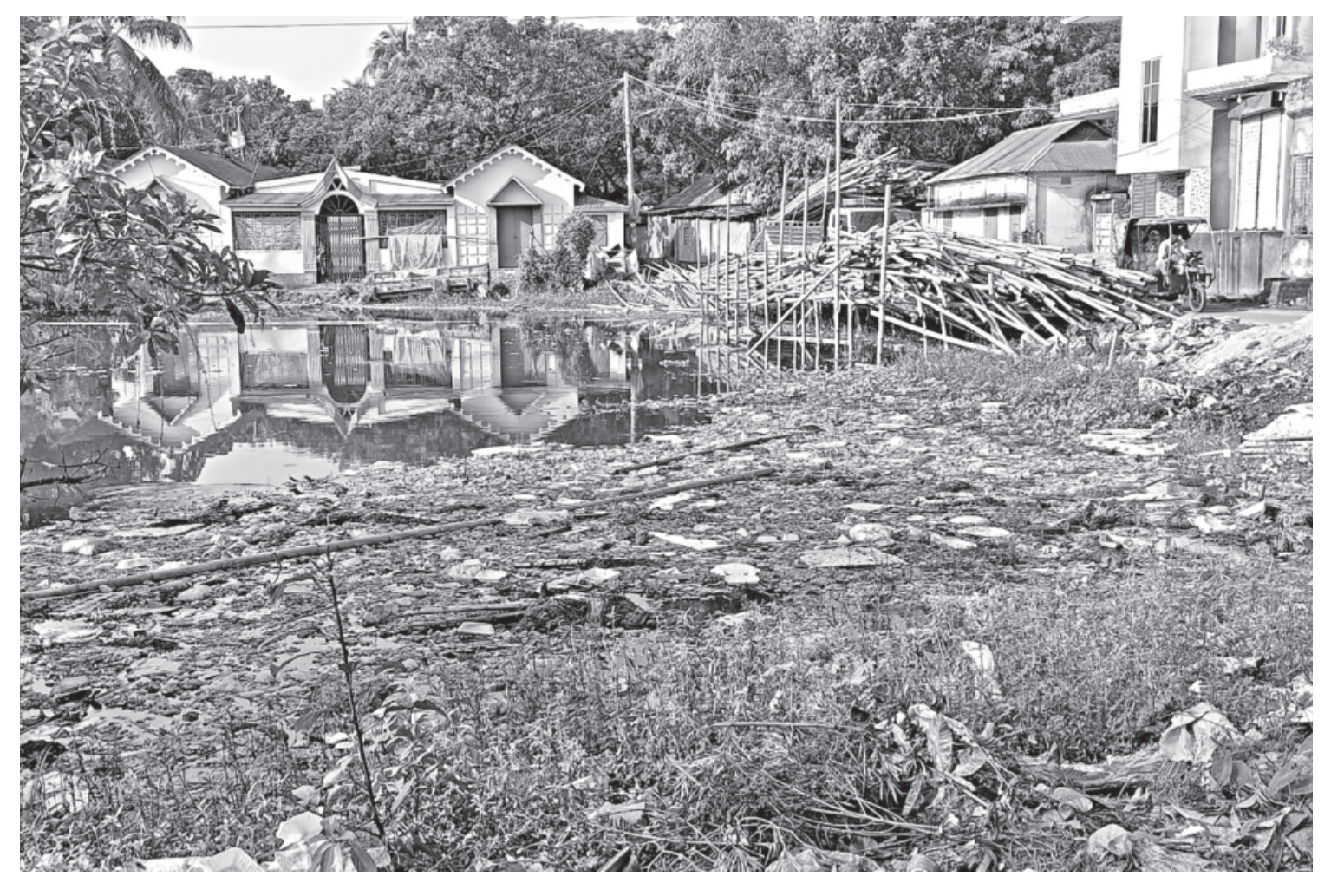
Once a source of clean water for Mymensingh locals, the pond adjacent to the twin-temple (Shree Shree Anandamoyee Shiva and Kali Mata Mandir) in Muktagachha, is now unhygienic for use. Due to encroachment, waste dumping, and lack of fund management, the century-old pond keeps getting more and more polluted despite the authority's efforts. This photo was taken recently.