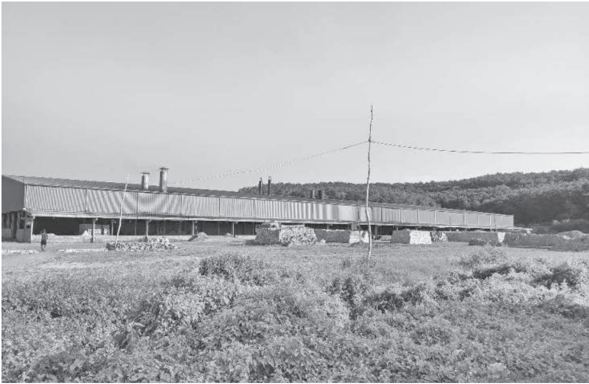
This brick-making factory has been running right beside a protected forest for years, with no clearance from the DoE. According to the law, setting up such an establishment within 2 km of a forest is illegal; this factory is within 200 metres. This photo was taken recently.