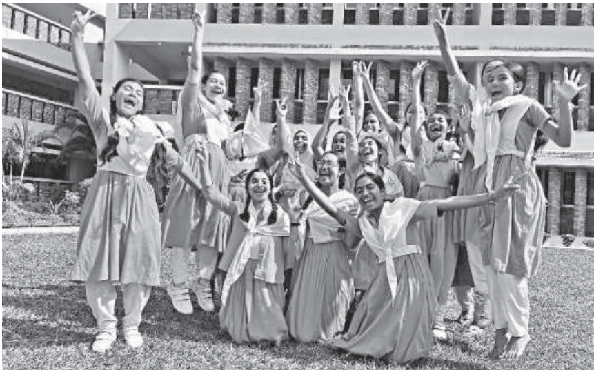
The students of Syeda Anjuman Ara Girls School rejoice after their SSC results got published on Monday. Established in 2018 at Chaudagram in Cumilla, the school achieved 100 percent pass rate in the last two years.