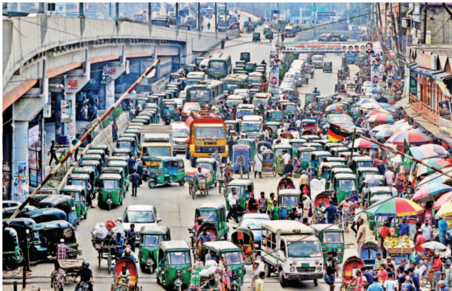
Hawkers, CNG-run three-wheelers, and rental vehicles occupy a part of the road near Jurain level crossing in the capital, making it difficult for traffic to flow smoothly. The photo was taken yesterday.