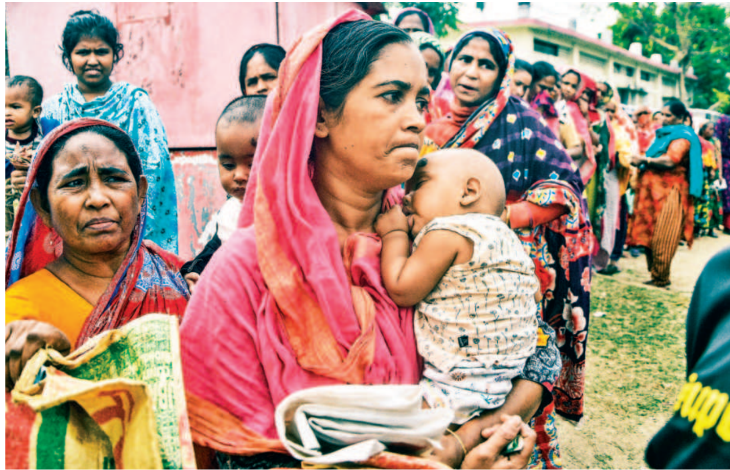
With despair and frustration painted all over her face, a woman holds her sleeping baby while waiting for her turn to purchase rice and flour at a subsidised rate from a TCB truck, under the government's OMS initiative, in Khulna city's No.5 terminal. With continuous hikes in the prices of essentials, the desperation of people from low-income groups for affordable food is increasing every day, and the women have nothing to do but bring their children to suffer in long lines along with them.