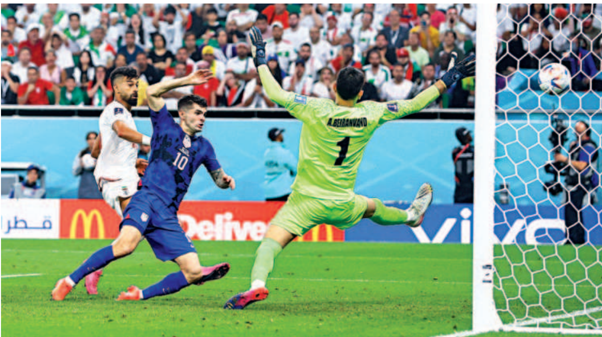
Christian Pulisic stepped up to score the decisive goal during the United States' 1-0 win over Iran at the Al Thumama Stadium in Doha. Although he was hurt in the process of bundling this effort home, the result means the USA progress to the last 16 where they will meet the Netherlands.