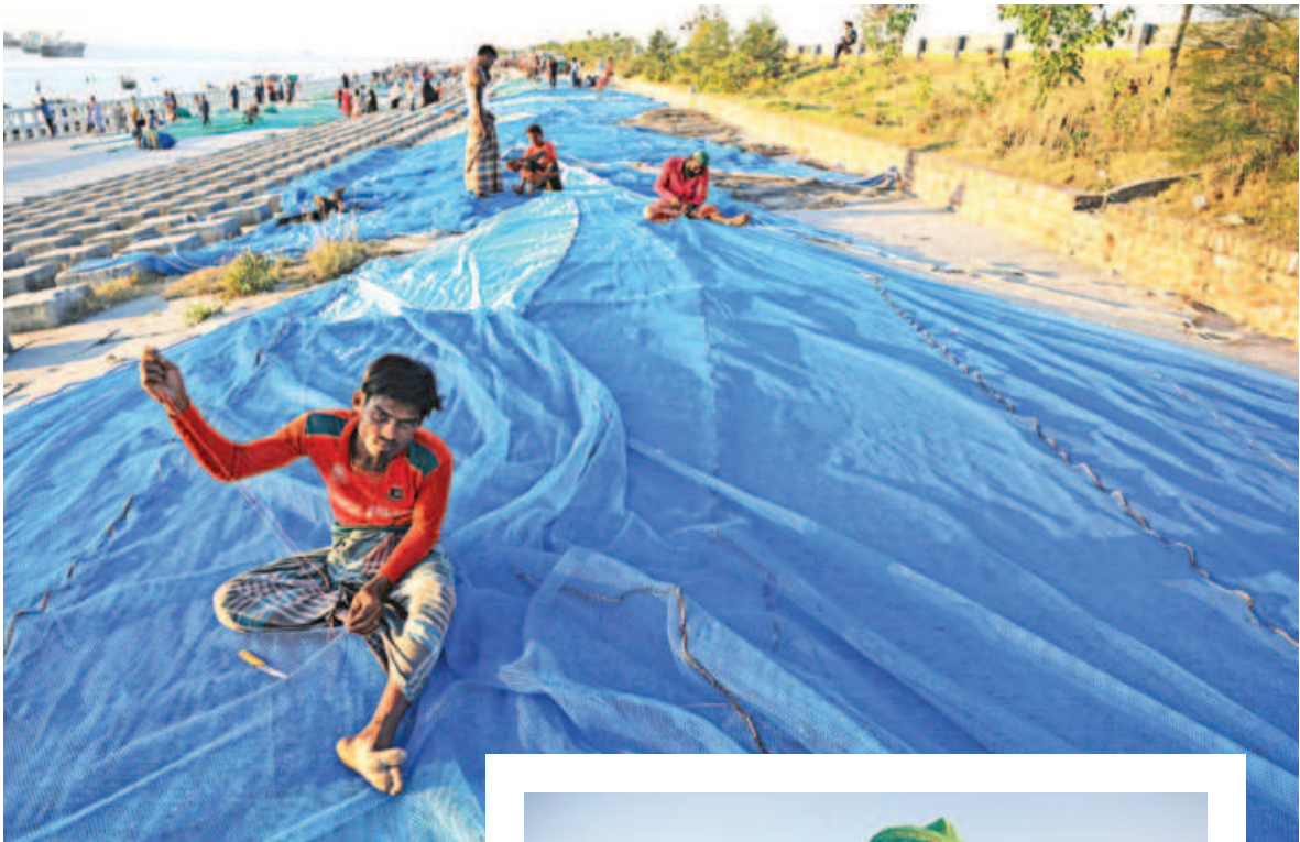
Fishermen sewing their nets in Chattogram's Patenga. More often than not, after capturing a haul, the fishing nets tear in places and the fishermen have to then take their time to repair and make them suitable for fishing again. The photo was taken recently. Inset, A man carries the repaired fishing nets to gather them at one spot for all the fishermen before they head back out to the sea.