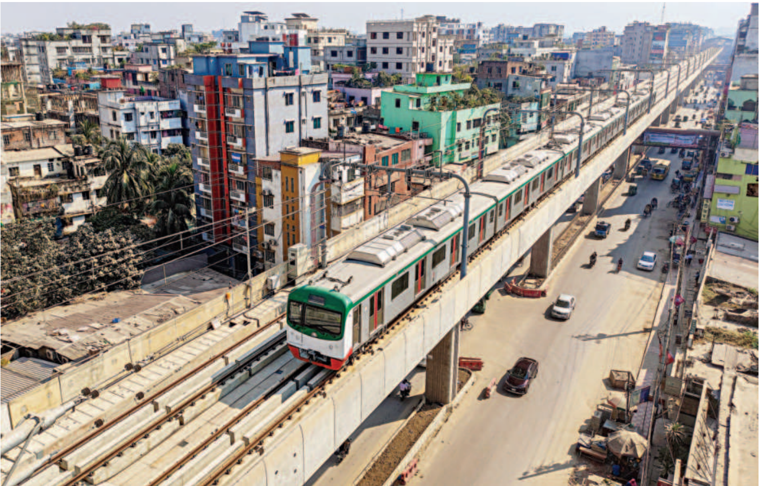
A trial run of the metrorail in Mirpur's Shewrapara around midday yesterday. The authorities concerned have been conducting regular tests ahead of the launch of its partial official operation at the end of next month.