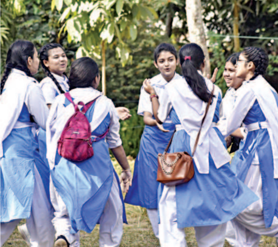
SSC examinees share moments of joy with their peers and teachers after the results got published yesterday. The photos were taken in Sylhet's Blue Bird High School and College, Tangail's Mirzapur Cadet College and Dhaka's Milestone College.