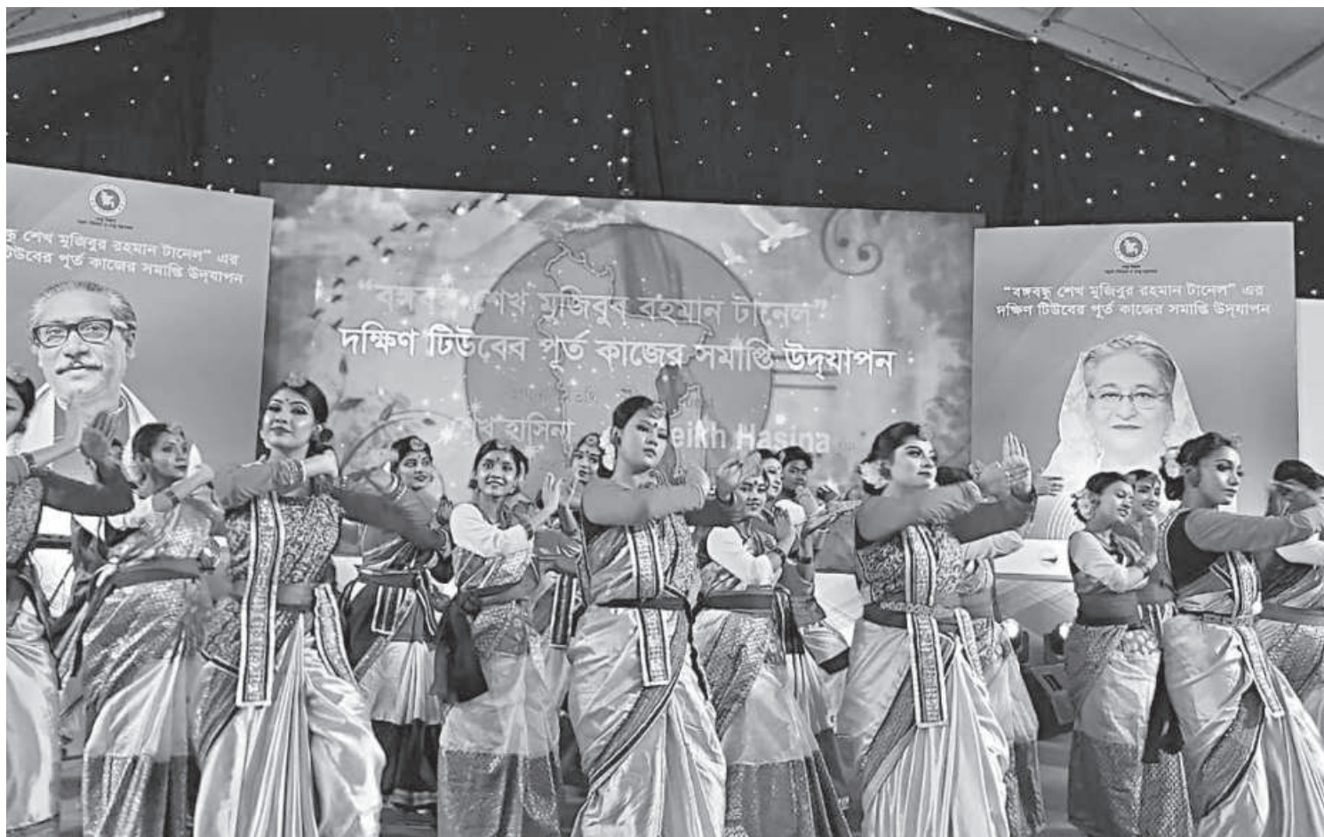
A group of dancers perform at an event marking the end to general construction work of Bangabandhu Sheikh Mujibur Rahman Tunnel's south tube, which goes beneath the Karnaphuli river. The prime minister joined the event, organised by the Bridges Division in Chattogram, virtually from her official residence Gono Bhaban and officially announced the completion. The photo was taken around 11:00am in the port city's Patenga region yesterday.