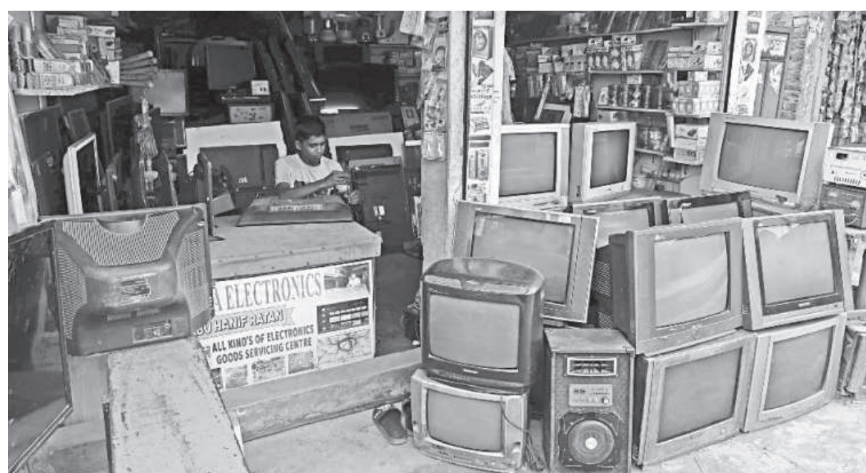
After buying old television sets, this local electronics store fixes and sells them to customers looking for a good deal. By selling these reconditioned TVs, the shop is indirectly reducing electronics waste. This photo was taken in Narayanganj's Fatullah town area recently.