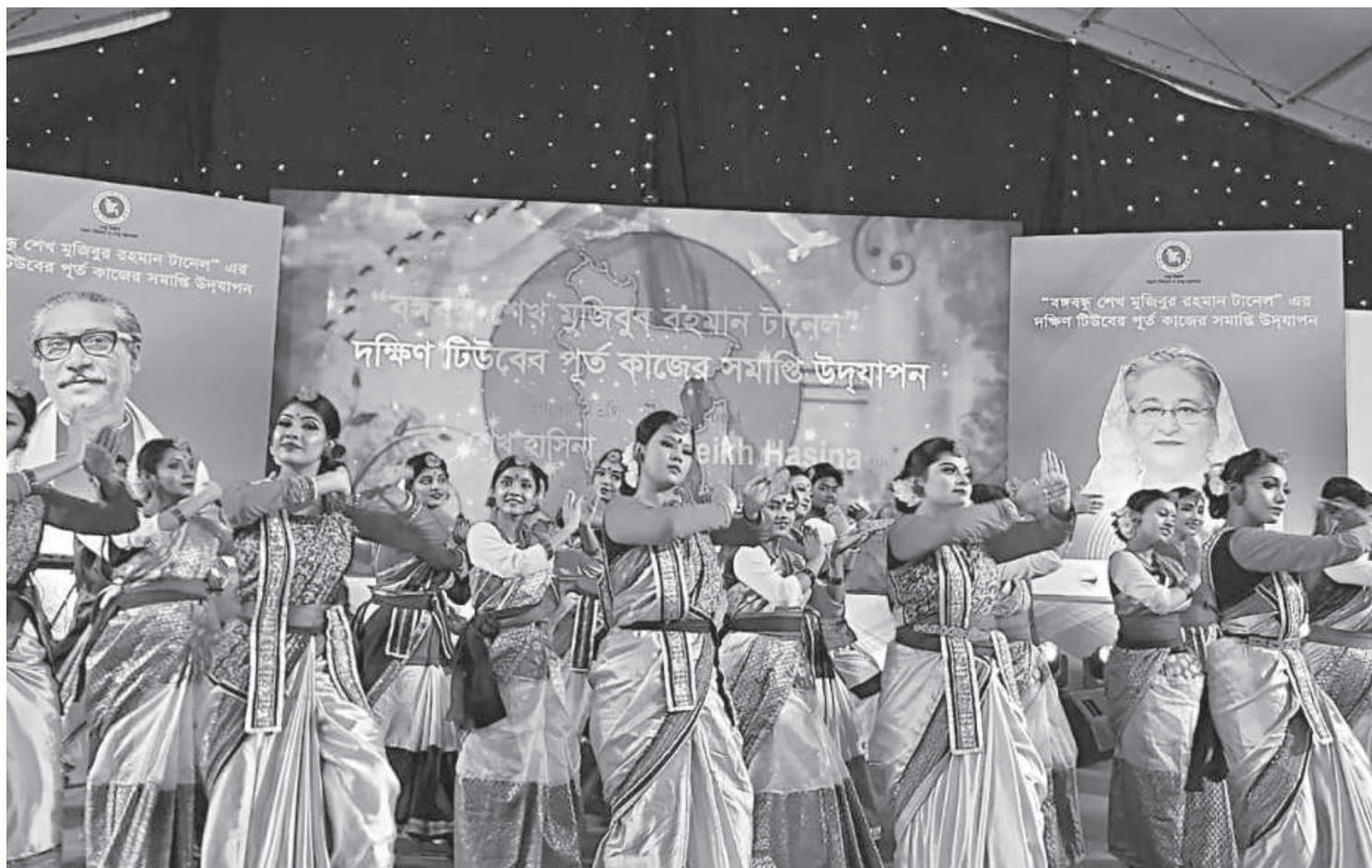
A group of dancers perform at an event marking the end to general construction work of Bangabandhu Sheikh Mujibur Rahman Tunnel's south tube, which goes beneath the Karnaphuli river. The prime minister joined the event, organised by the Bridges Division in Chattogram, virtually from her official residence Gono Bhaban and announced the completion. The photo was taken around 11:00am in the port city's Patenga region yesterday.