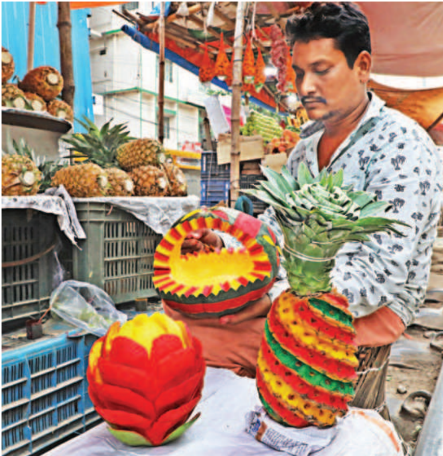
Amid the wedding season, this fruit seller has picked up a unique business. He carves these fruits and vegetables for special ceremonies, and paints them with different colours. These items will eventually adorn tables as ornamental pieces. Based on the size of the fruit or vegetable, the price of per item varies. This photo was taken in Narayanganj rail gate area recently.