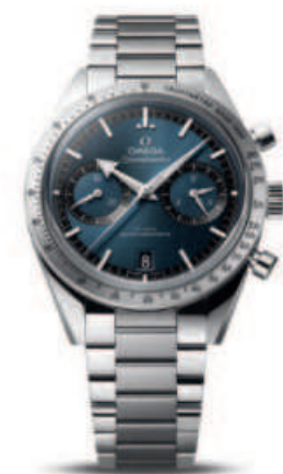
SPEEDMASTER '57 Co-Axial Master Chronometer