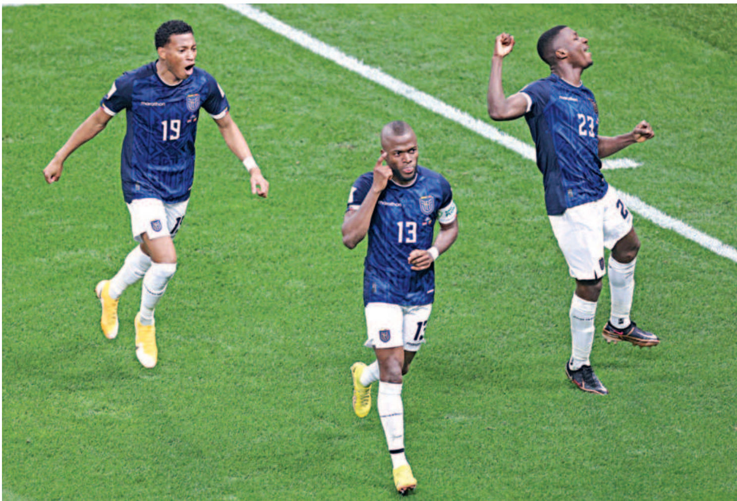
Enner Valencia (C) celebrates with teammates after scoring Ecuador's equaliser against Netherlands during in 1-1 draw at the Khalifa International Stadium in Doha yesterday. Valencia, currently the leading scorer of the World Cup with three goals, was later stretchered off for injury.