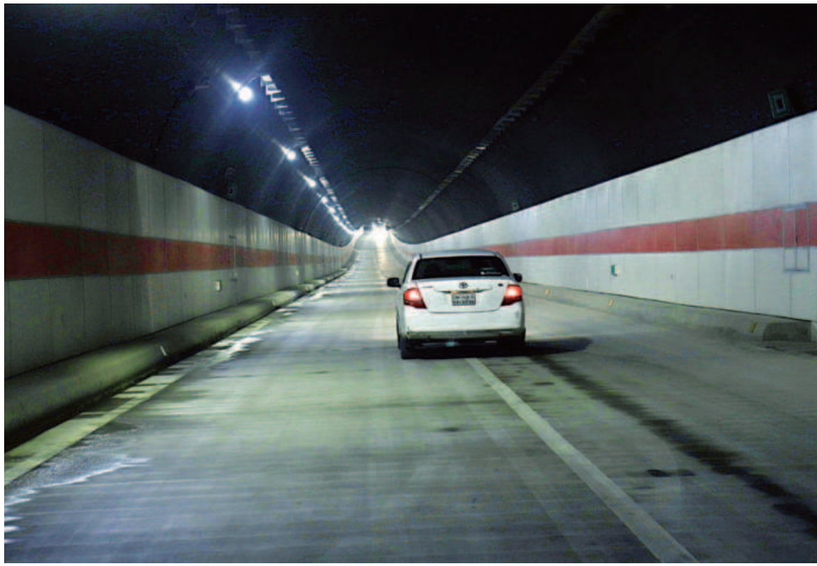
An inside view of the two-tube Bangabandhu Sheikh Mujibur Rahman Tunnel under the Karnaphuli river in Chattogram, which is expected to be partially opened to traffic by the end of January. Bangladesh Bridge Authority is celebrating the completion of the tunnel's south tube today. The photo was taken yesterday.