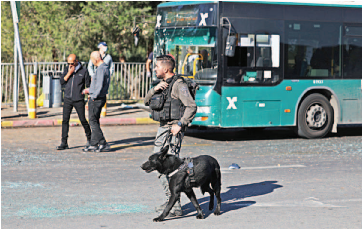
A member of the Israeli security forces holds a sniffer dog at the scene of an explosion at a bus stop in Jerusalem yesterday. At least one person was killed and 15 others wounded in two separate explosions targeting bus stations in Jerusalem, security and medical officials said, with Israel's public security minister calling them "attacks."

AFP, Washington A Walmart employee shot dead six people at a store bustling with Thanksgiving holiday shoppers, before turning the pistol on himself, police said yesterday, in the country's second mass shooting in four days. Four other people remained hospitalized in unknown condition following the Tuesday night rampage in the Walmart in Chesapeake, Virginia, police chief Mark Solesky said. Solesky told a news conference the gunman was believed to have died of a "self-inflicted gunshot wound," and that the motive behind the latest attack in America's gun violence crisis was not immediately known. The assault two days before Thanksgiving, the quintessential American family holiday marked this year on November 24, followed a weekend gun attack at an LGBTQ club in Colorado that killed five people.