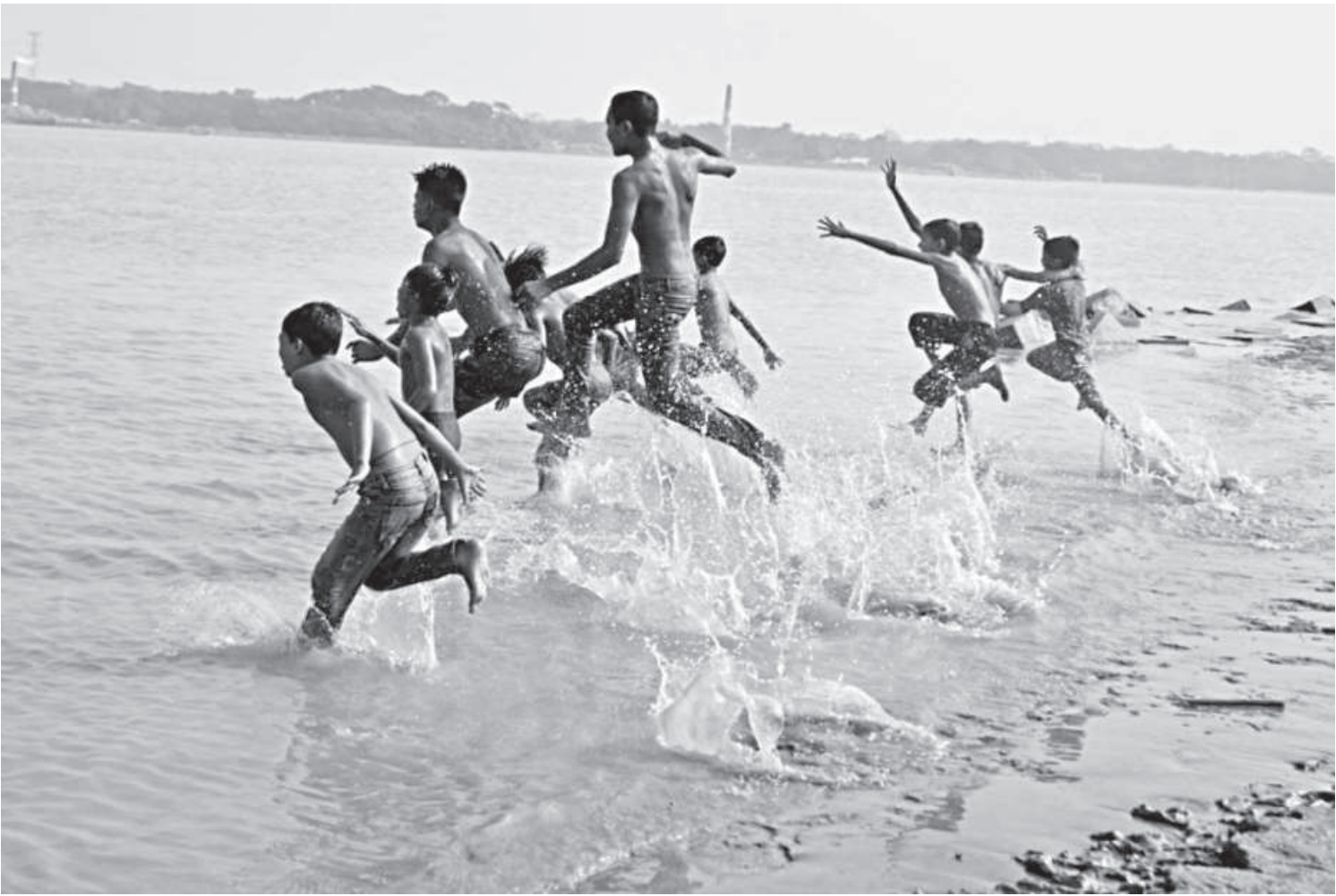
A group of children race towards Kirtankhola river with their spirits high, excited to have a bit of fun while taking a dip. This photo was taken in Barishal's Palashpur area yesterday.