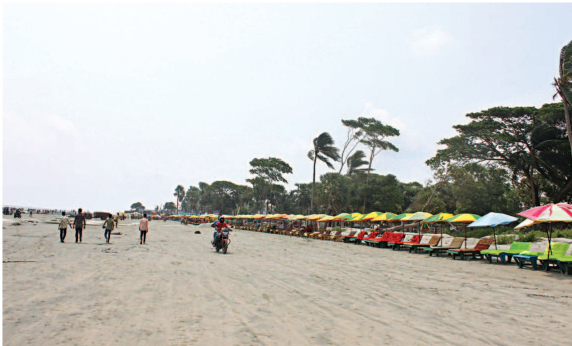
The Kuakata sea beach has seen a considerable increase in tourists ever since the opening of Padma Bridge. However, local officials feel there is great potential to enhance people's visits by implementing various measures, such as introducing a cruise.