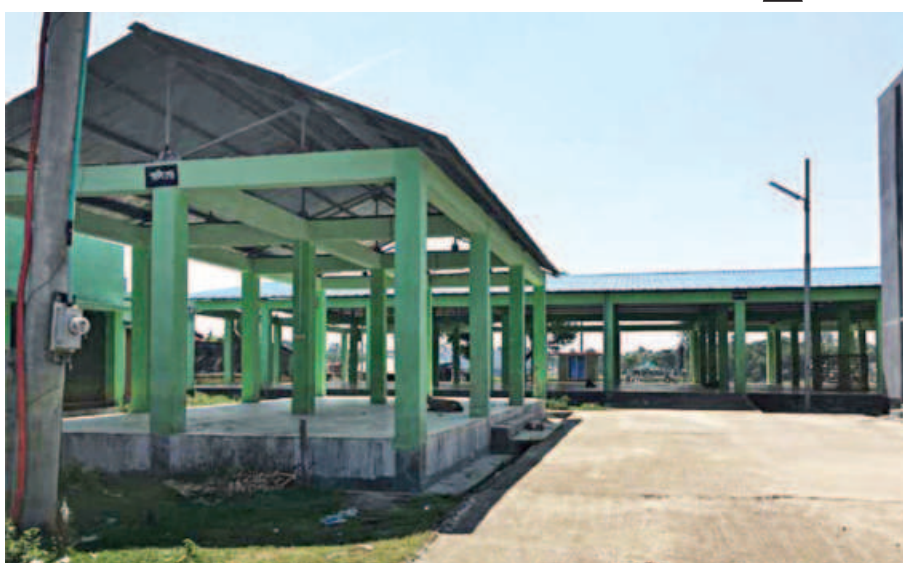
Establishment of fish landing stations such as this would help implement the blue economy, which relates to sustainably harvesting marine resources.