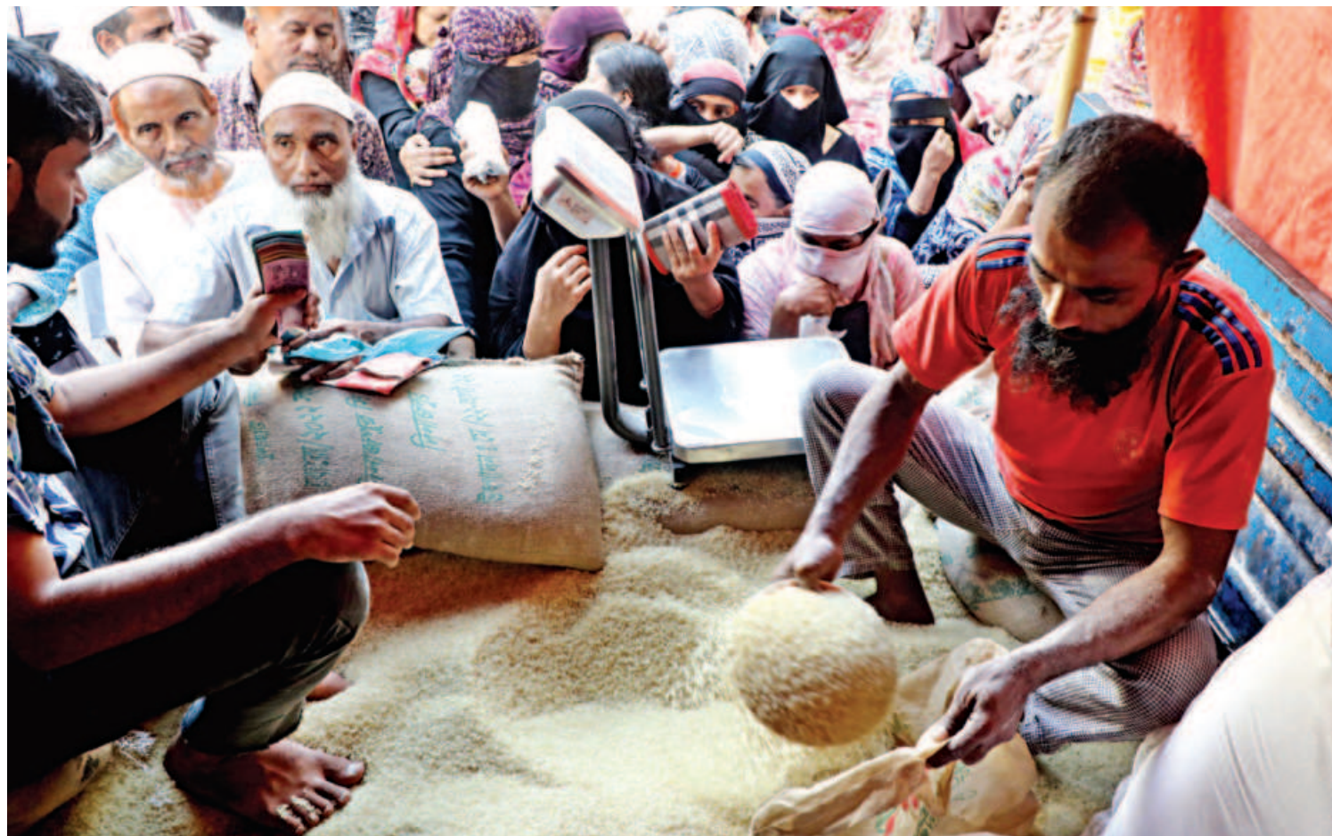
Rice being sold at a subsidised rate of Tk 30 per kilogramme from a truck under the government's open market sale initiative at the Mohammadpur bus stand in the capital on Monday. Sales of rice and wheat flour through the initiative have declined 25 per cent year-on-year to 2.71 lakh tonnes in the first four months of the current fiscal year, according to the food ministry.