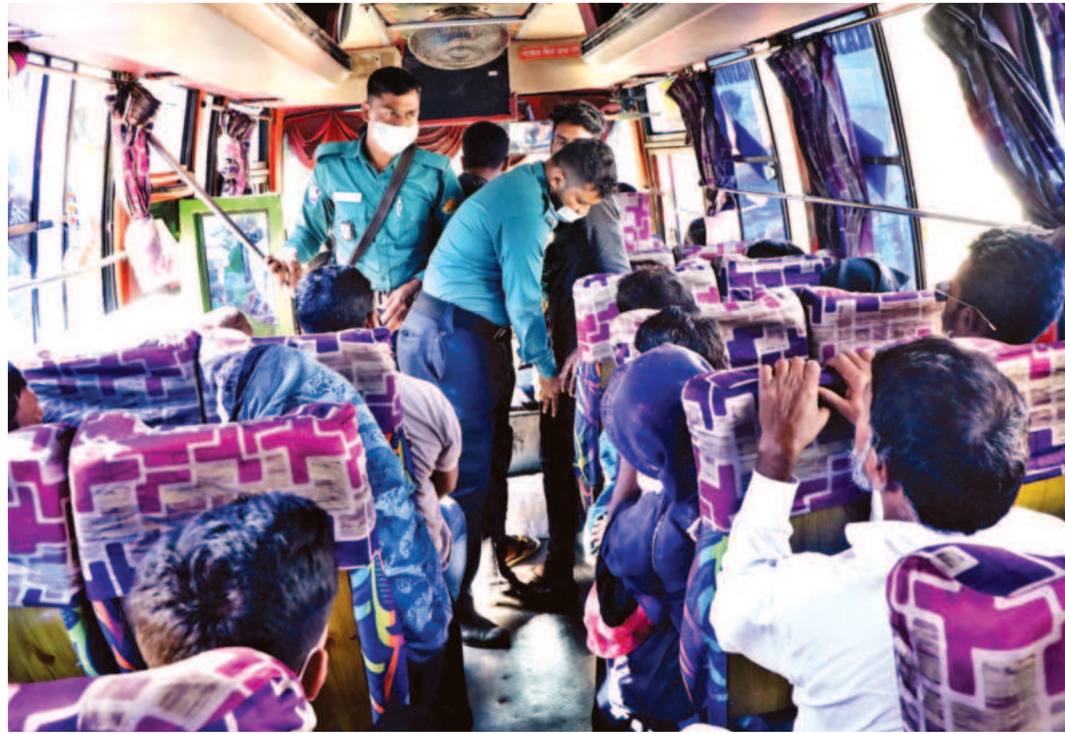
Policemen frisking passengers in a bus in the capital's Galtoli yesterday. Checkpoints were set up and a red alert was issued across the country following the escape of two militant convicts from the premises of a court in Old Dhaka.