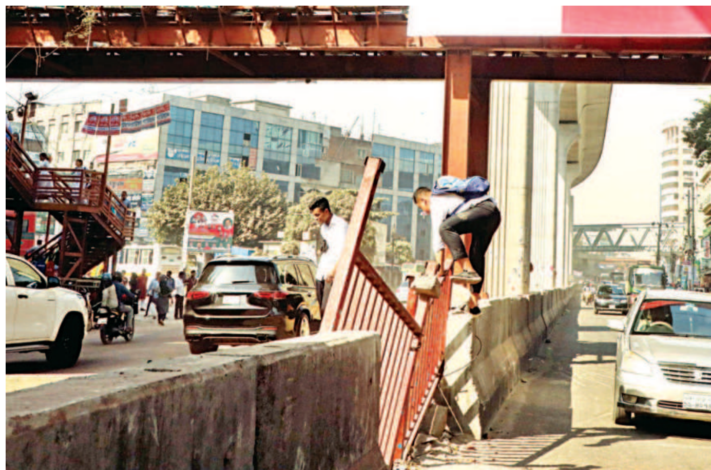
Risking life and limb, a man jumping over the central reservation just below a footbridge to cross Kazi Nazrul Islam Avenue, one of the busy thoroughfares in the capital. Another is standing there after having done the same. The photo was taken in Farmgate area around 12:30pm yesterday.