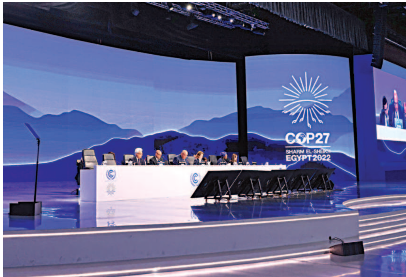
Egypt's Foreign Minister Sameh Shukri, heads the closing session of the COP27 climate conference, at the Sharm el-Sheikh International Convention Centre in Egypt's Red Sea resort city of the same name, yesterday.