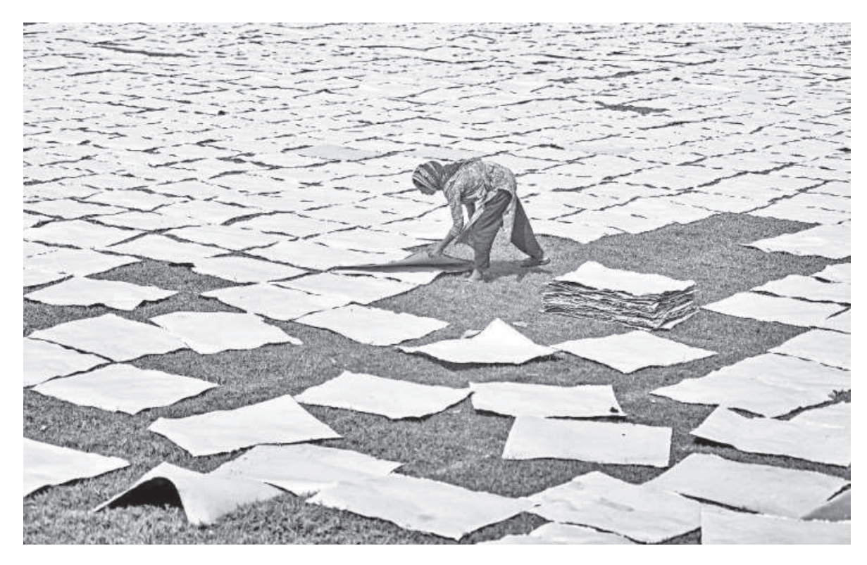
Workers are drying the sheets of paper that have been recycled from old cardboard boxes. Once ready, these sheets are used to make all kinds of containers. A kilo of this material is sold for Tk 45. This photo was taken in Khulna's Dumuria area recently.

Her namaz-e-janaza will be held after Isha prayers today at Gulshan Society Jame Masjid. She will be buried at Banani graveyard.