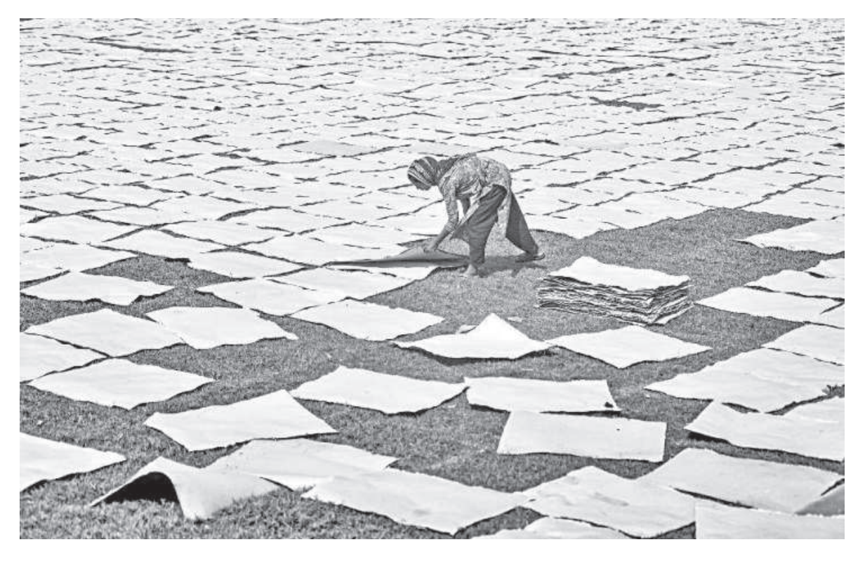
Workers are drying the sheets of paper that have been recycled from old cardboard boxes. Once ready, these sheets are used to make all kinds of containers. A kilo of this material is sold for Tk 45. This photo was taken in Khulna's Dumuria area recently.