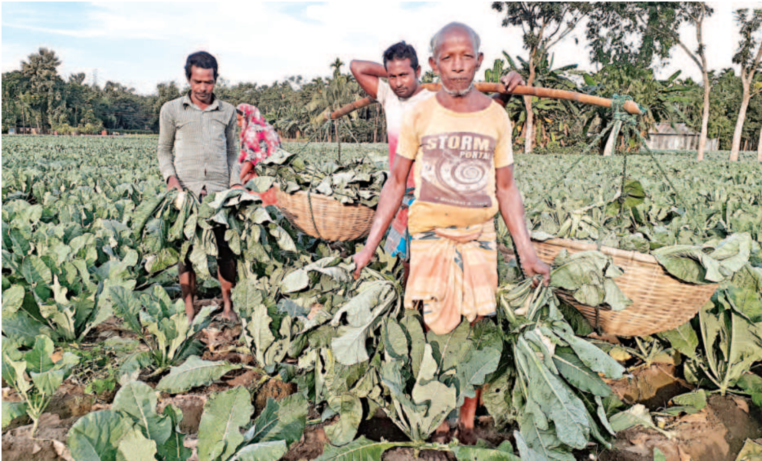
Farmers harvest an early variety of cauliflower at Karnapur village of Mogholhat union in Lalmonirhat sadar upazila recently. Around 19,000 hectares of land have been cultivated in Rangpur, Gaibandha, Nilphamari, Kurigram and Lalmonirhat this year. As much as 6,400 kilogrammes can be availed from each hectare of land with an investment of Tk 80,000. Farmers get Tk 50 per kilogramme while at retail markets consumers pay a bit higher, around Tk 60 to Tk 65.