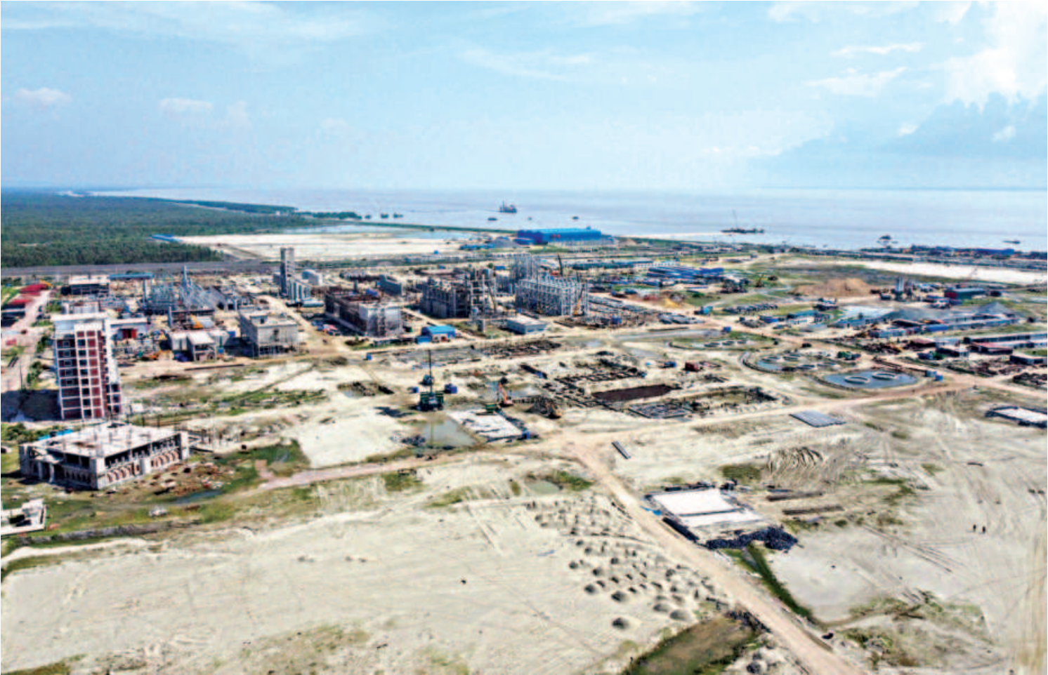
An aerial view of the Bangabandhu Sheikh Mujib Shilpa Nagar. Once fully ready, it will be one of the biggest industrial enclaves in South and Southeast Asia. The photo was taken recently.