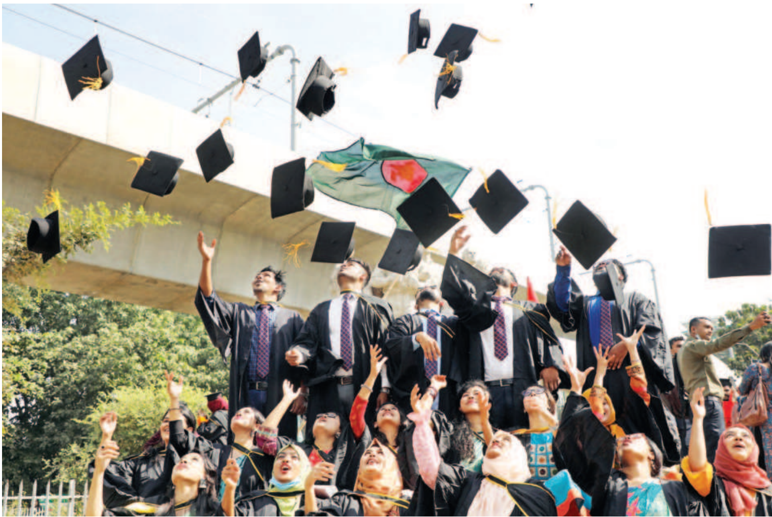
CELEBRATION IN THE AIR... The graduates of Dhaka University celebrate during the university’s 53rd convocation. The programme had been postponed due to the pandemic. The photo was taken in front of Raju Memorial Sculpture yesterday.