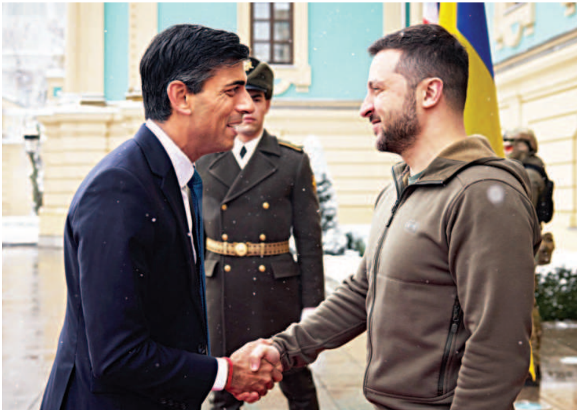
Ukrainian President Volodymyr Zelenskyy welcoming British Prime Minister Rishi Sunak prior to their meeting in Kyiv. Sunak vowed his country would stand by Kyiv “until Ukraine has won”.