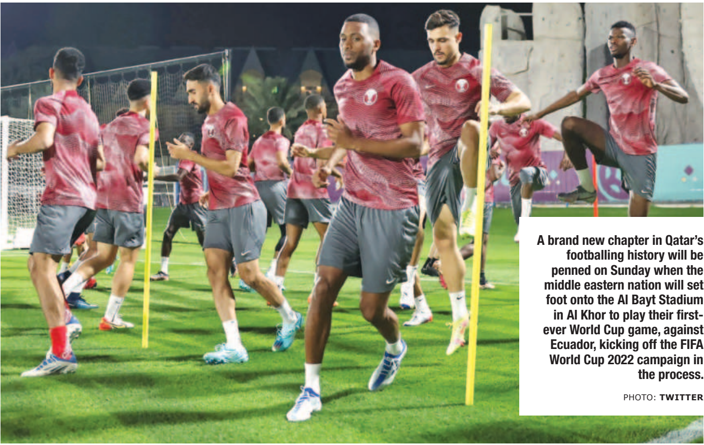
A brand new chapter in Qatar’s footballing history will be penned on Sunday when the middle eastern nation will set foot onto the Al Bayt Stadium in Al Khor to play their first-ever World Cup game, against Ecuador, kicking off the FIFA World Cup 2022 campaign in the process.

“This one-sided moral lesson is just hypocrisy...I don’t want to give you any lessons of life, but what is going on here is profoundly, profoundly unjust.”