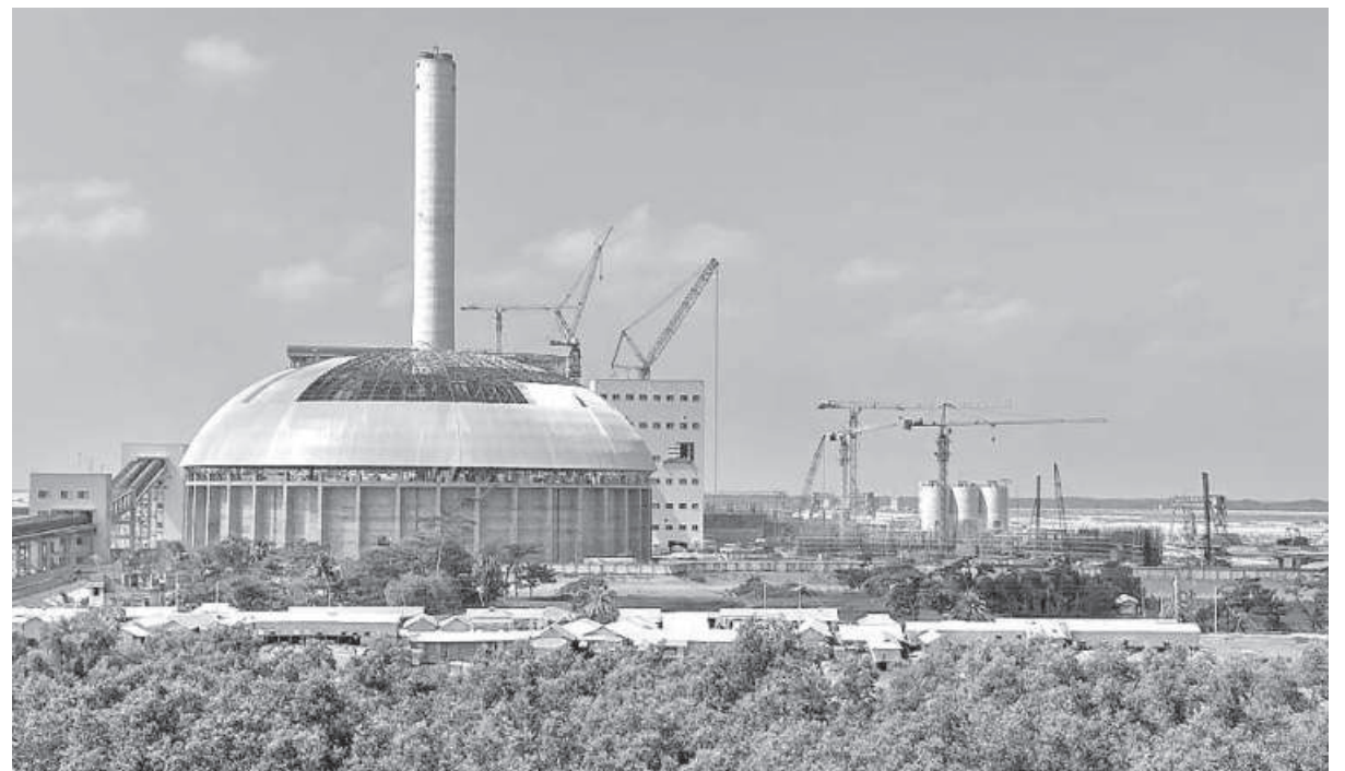
The elevated price of coal in the international market suggests that electricity from the Payra coal-fired plant would be costlier than the rate calculated last year.

According to the Infrastructure Development Company Ltd (IDCOL), industrial rooftops could accommodate 5,000MW of solar power systems. Since net metering guidelines are already in place, industries could take advantage of cost-competitive renewable energy