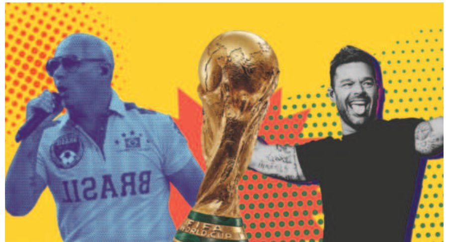
DESIGN: ABIR HOSSAIN