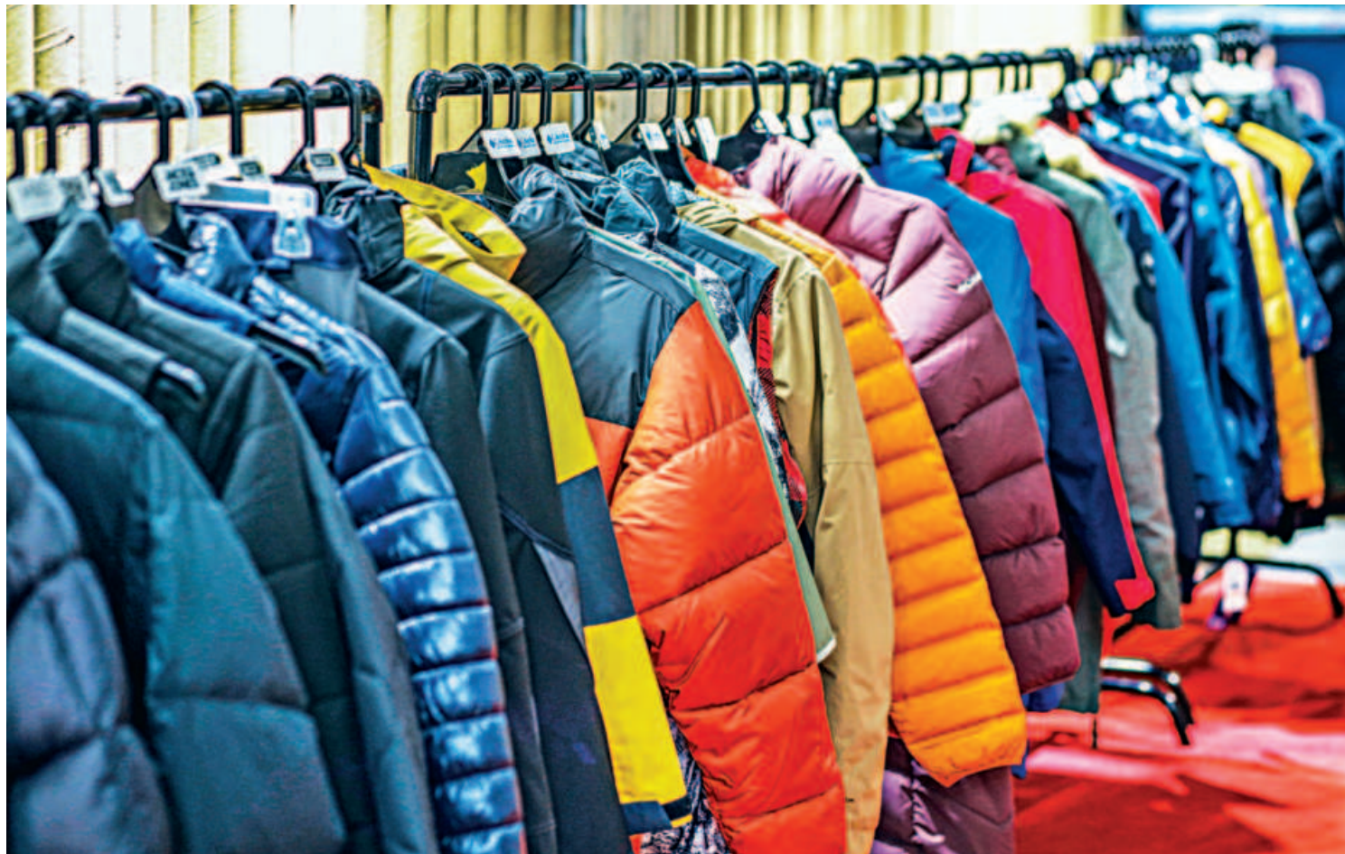
Bangladesh, which raked in $42.61 billion in garment exports in the last financial year, has a 6.8 per cent market share in the global apparel supply chain. The photo was taken from a fair organised as part of the Made in Bangladesh Week 2022 at Bangabandhu International Conference Centre in Dhaka on Monday.