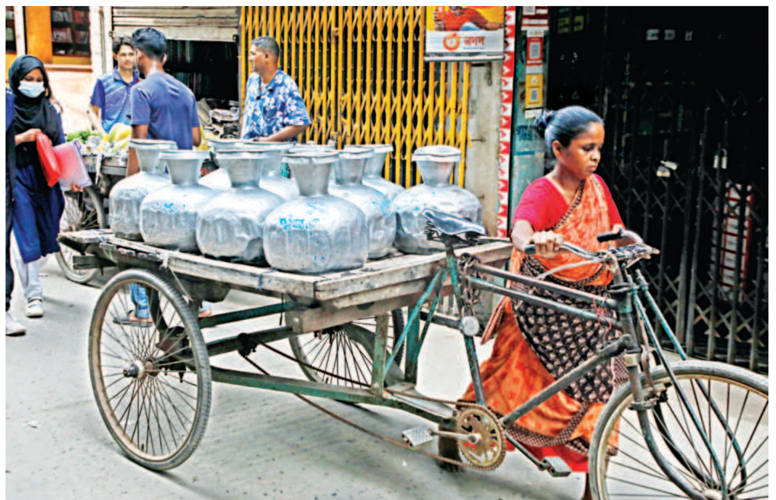
A woman pulls a van carrying pitchers full of water to sell to roadside vendors and stores. As most of these establishments don't have direct water-line access, the shopkeepers buy each pitcher from her for Tk 10 to 15, which saves them the trouble of getting the water themselves. This photo was taken in Old Dhaka's Banglabazar area recently.