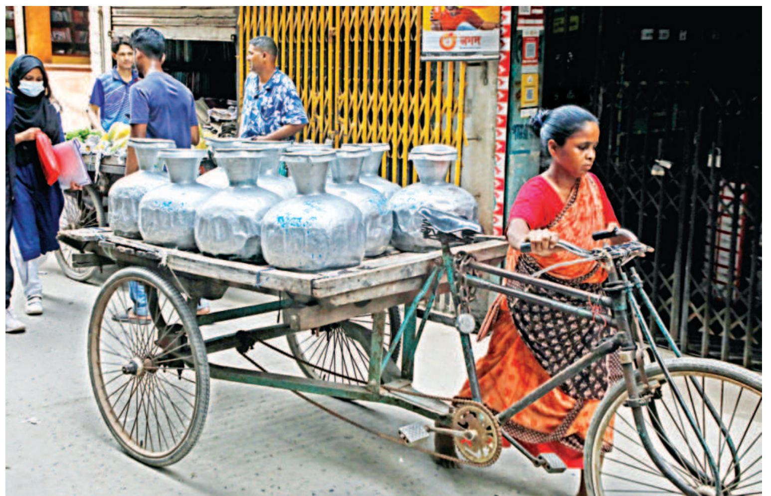
A woman pulls a van carrying pitchers full of water to sell to roadside vendors and stores. As most of these establishments don't have direct water-line access, the shopkeepers buy each pitcher from her for Tk 10 to 15, which saves them the trouble of getting the water themselves. This photo was taken in Old Dhaka's Banglabazar area recently.