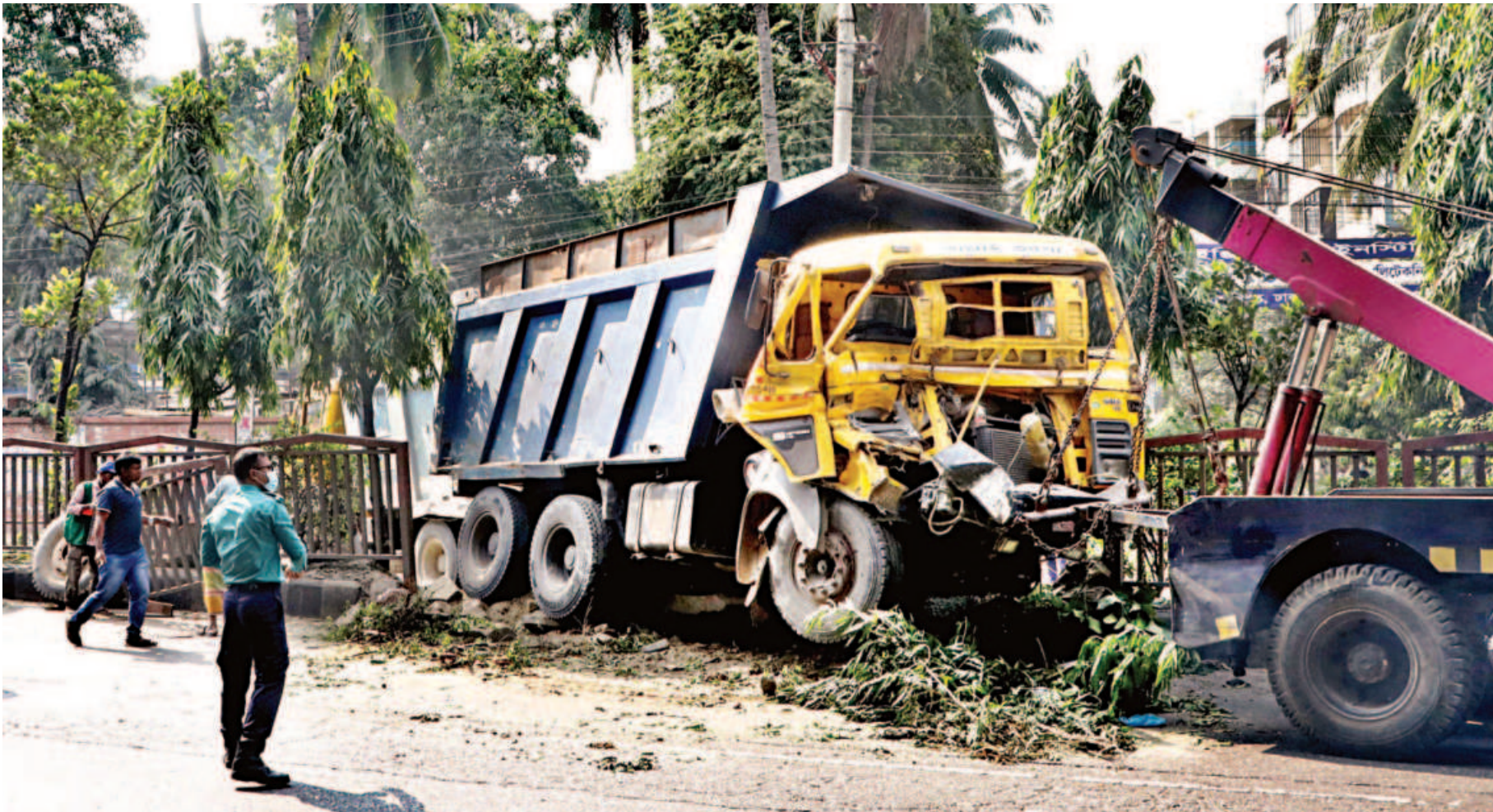
Two trucks collided with each other in the break of dawn yesterday at Asad Gate area. As an aftermath of the collision, one of the stone-carrying trucks lost control and went over the divider, while the other one sped away. Locals claimed that the two vehicles were trying to overtake one another. Authorities went there to move the damaged truck, whose driver fled, from the premises around 11:00am.