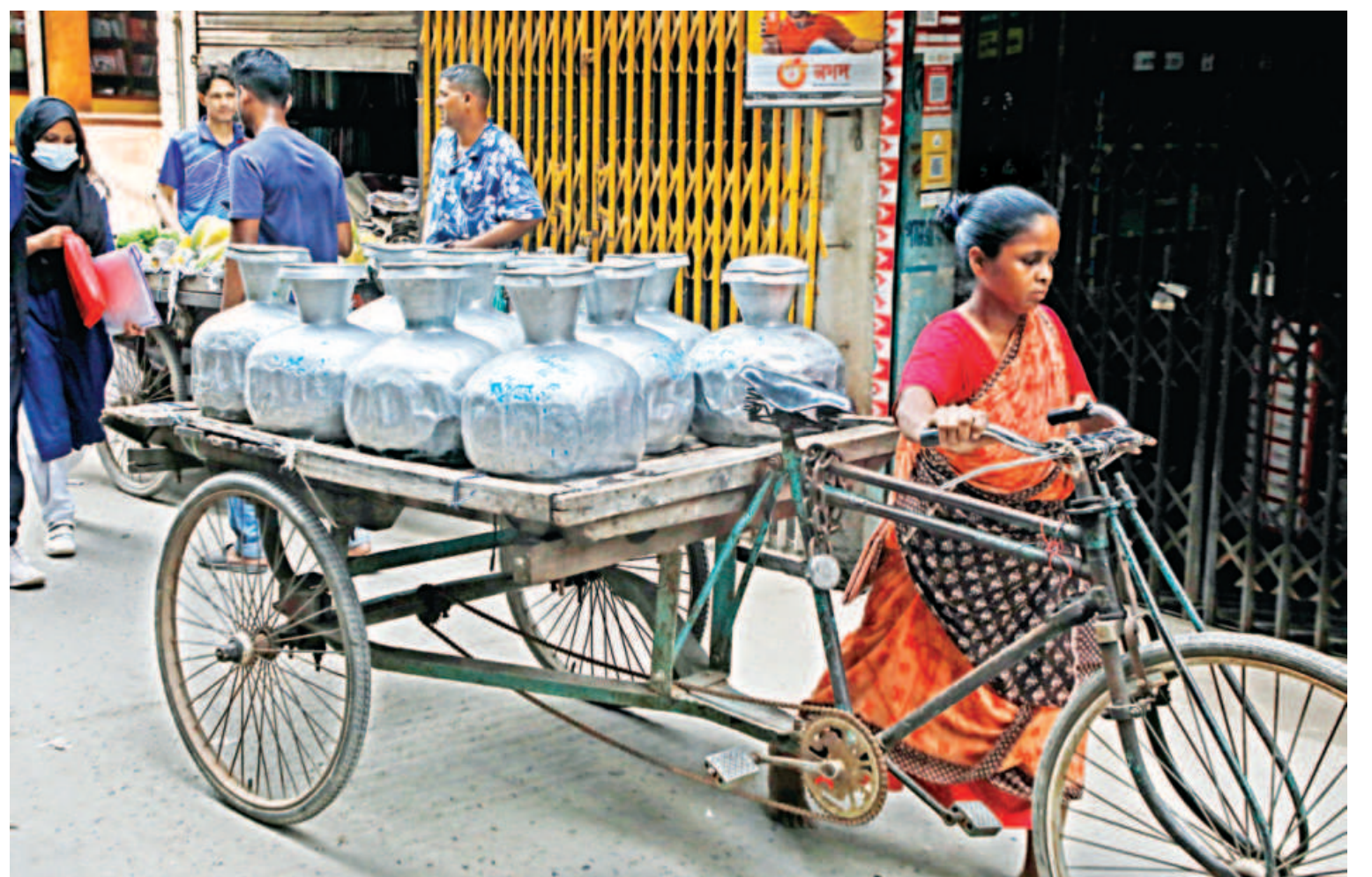
A woman pulls a van carrying pitchers full of water to sell to roadside vendors and stores. As most of these establishments don't have direct water-line access, the shopkeepers buy each pitcher from her for Tk 10 to 15, which saves them the trouble of getting the water themselves. This photo was taken in Old Dhaka's Banglabazar area recently.