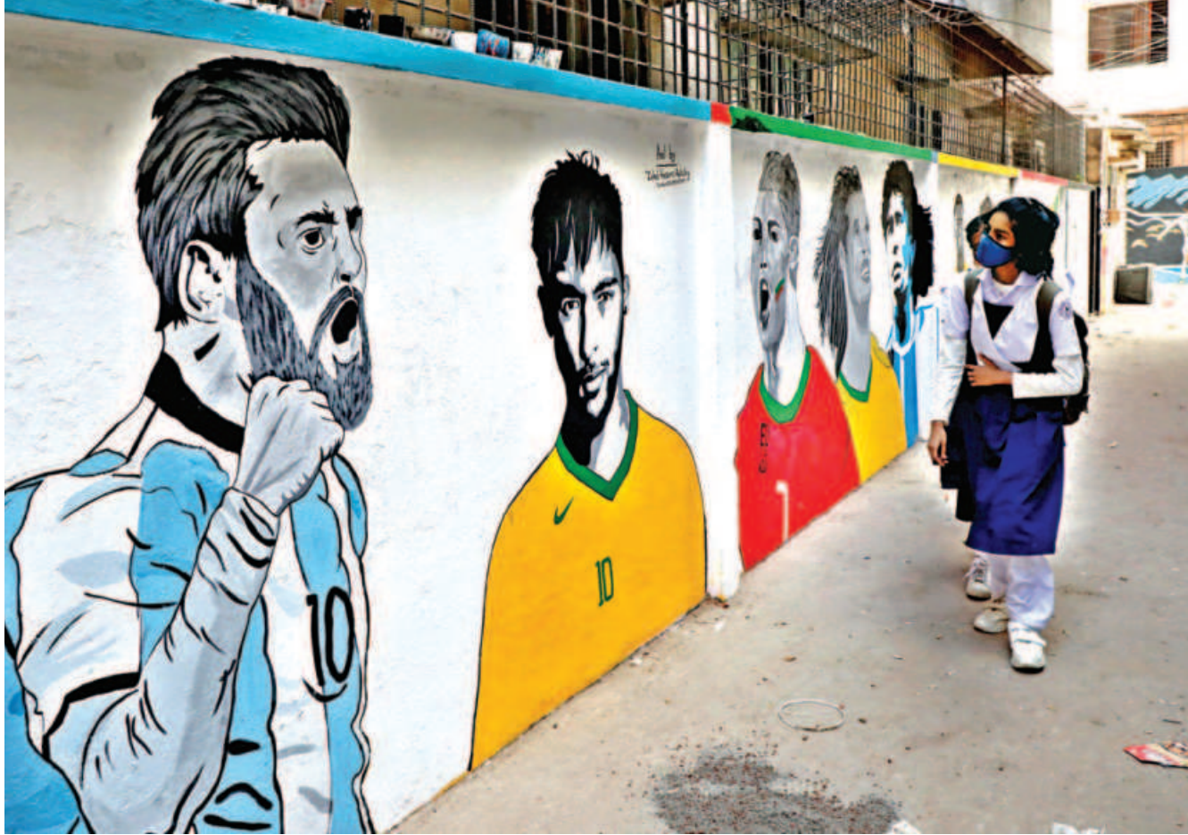
Schoolchildren looking at murals of Lionel Messi, Neymar, Cristiano Ronaldo and other football stars on a wall in Old Dhaka's KM Das Lane on Monday. The paintings of famous footballers of present and past have been drawn by youngsters of the locality as football fever grips the nation with only four days left to the start of the FIFA World Cup in Qatar.