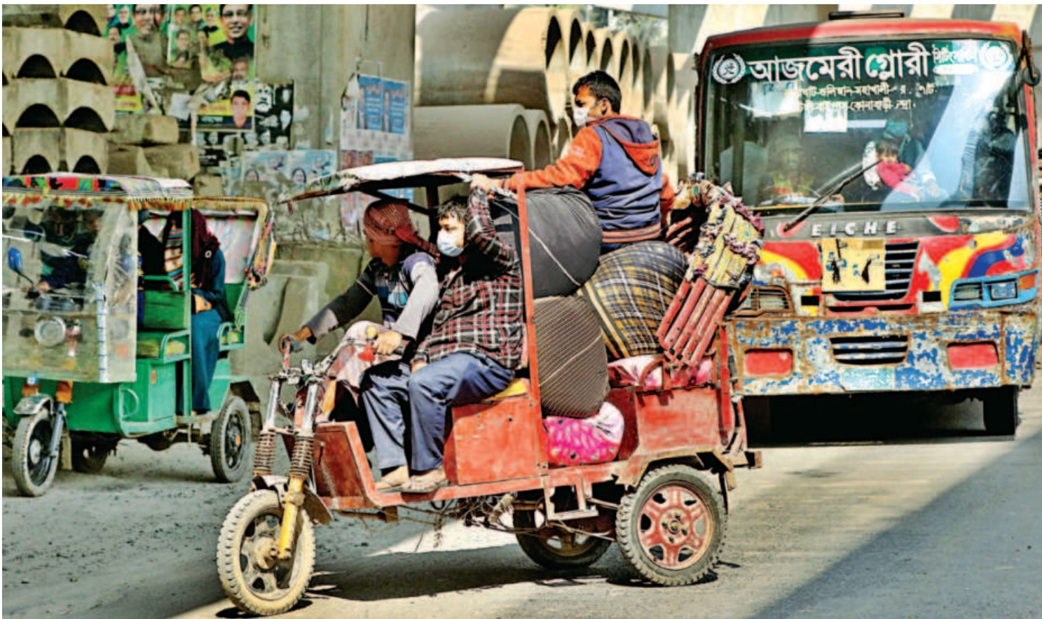
A large number of unregistered battery-run three-wheelers continue to operate illegally on the Dhaka-Mymensingh highway despite a 2015 ban and a High Court directive. This frequently results in fatal accidents and long tailbacks on the highway. The photo was taken recently in Tongi, Gazipur.