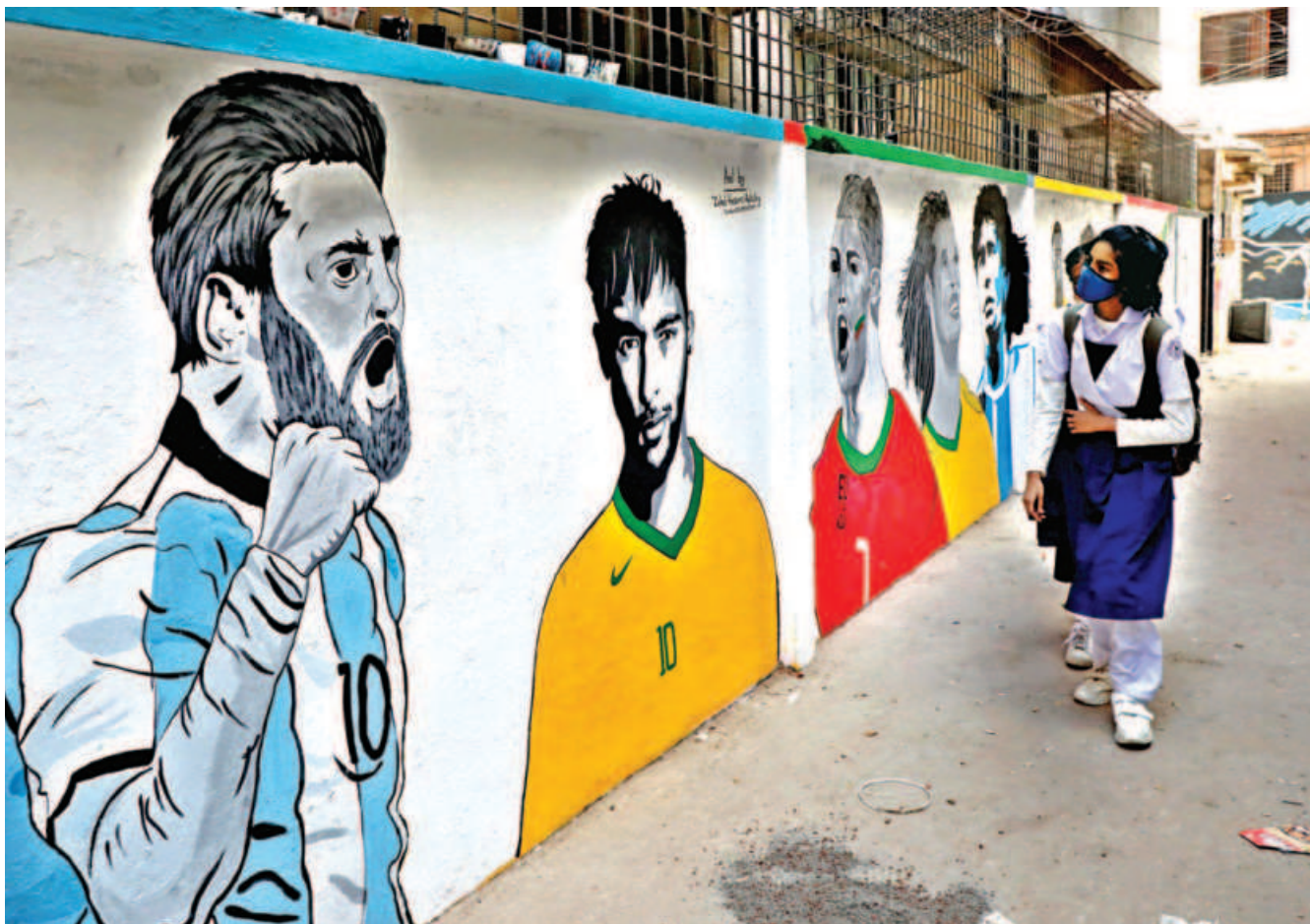
Schoolchildren looking at murals of Lionel Messi, Neymar, Cristiano Ronaldo and other football stars on a wall in Old Dhaka's KM Das Lane on Monday. The paintings of famous footballers of present and past have been drawn by youngsters of the locality as football fever grips the nation with only four days left to the start of the FIFA World Cup in Qatar.