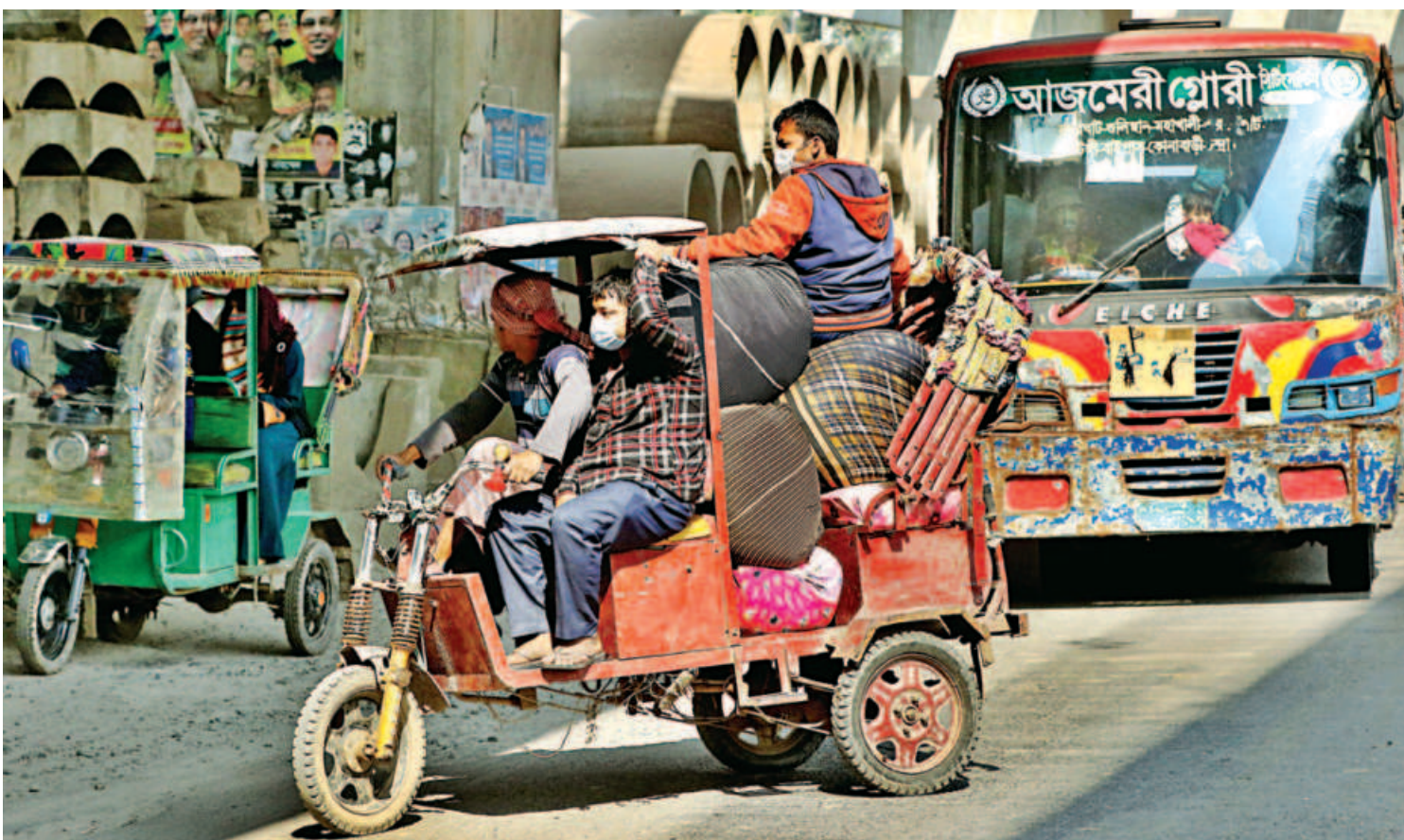
A large number of unregistered battery-run three-wheelers continue to operate illegally on the Dhaka-Mymensingh highway despite a 2015 ban and a High Court directive. This frequently results in fatal accidents and long tailbacks on the highway. The photo was taken recently in Tongi, Gazipur.