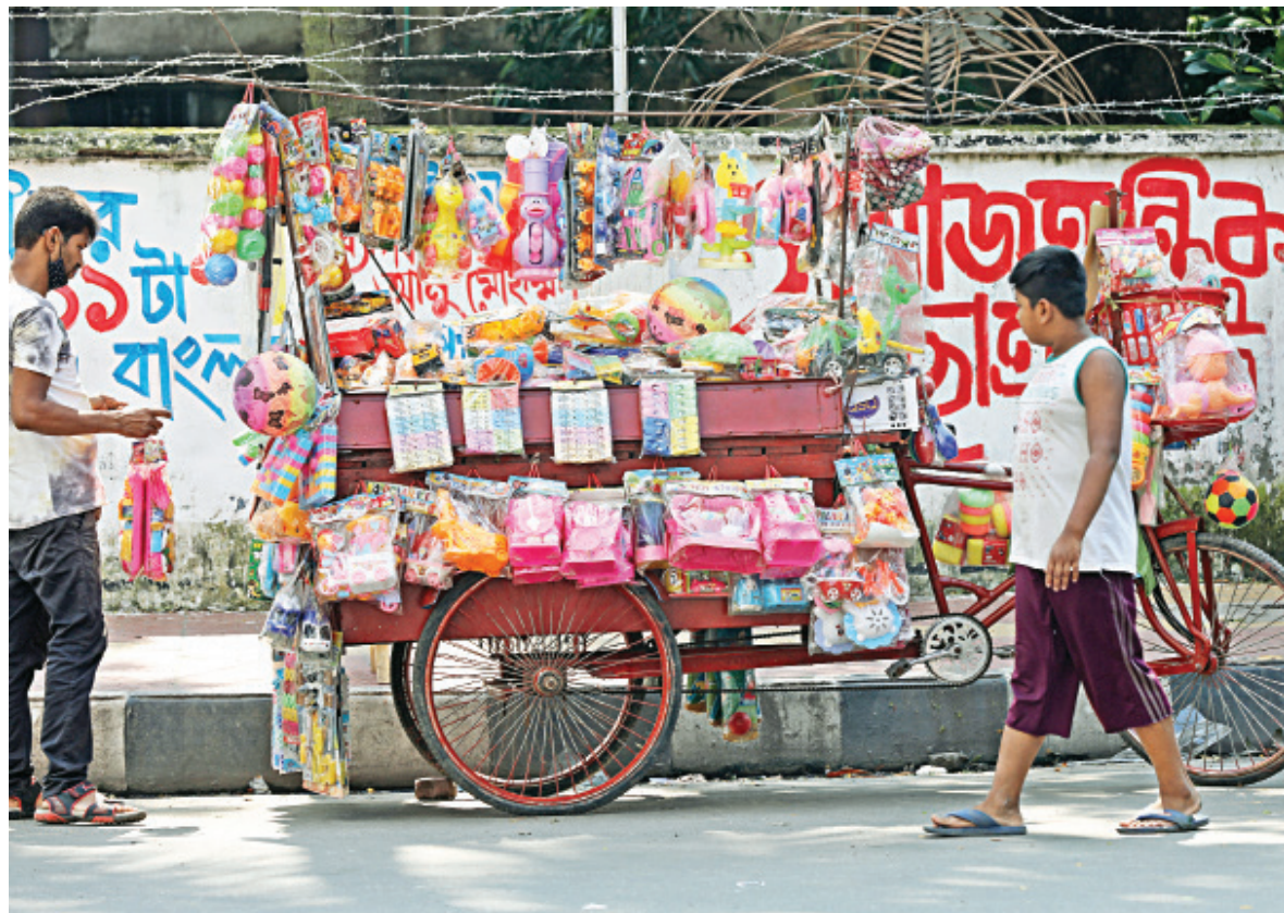
A child turns his head while passing by a colourful toy van in Dhaka University area. With a wide range toys, this vendor goes around the area to attract the little ones who accompany their parents or relatives during their recreational visit there. This photo was taken recently.