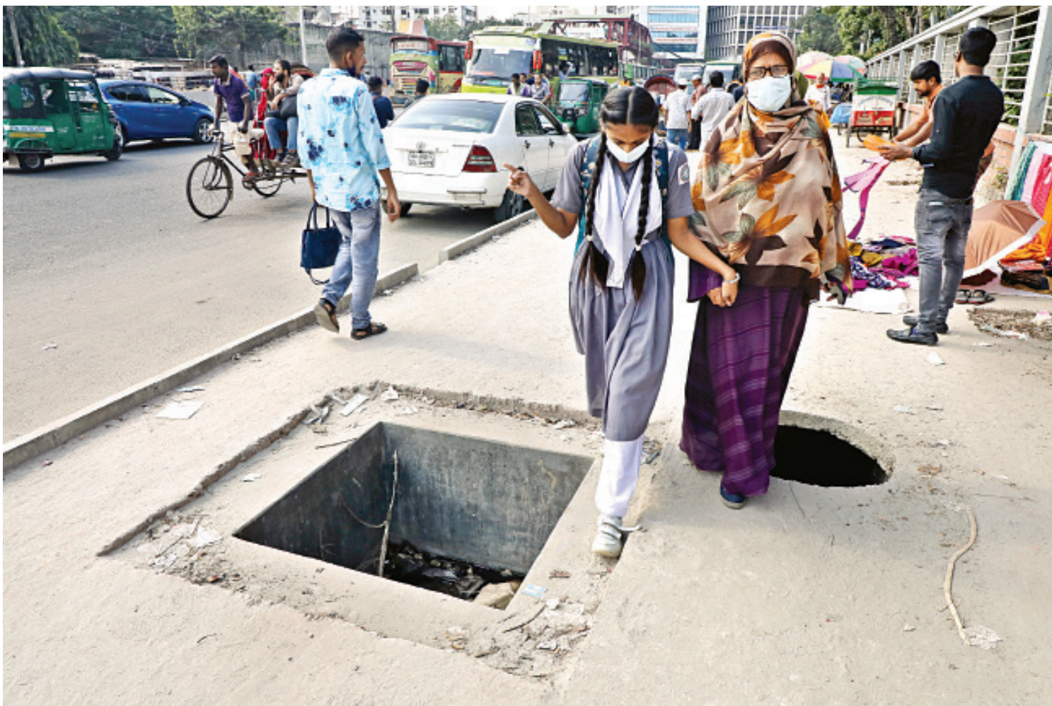
A school student carefully passes the uncovered manhole on the road in front of National Institute of Ophthalmology and Hospital in Agargaon. Many accidents involving open manholes have been reported in the area over the last month. This photo was taken recently.