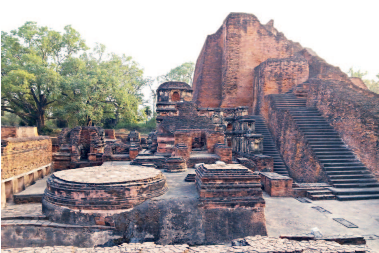
(L) A stupa dedicated to Sariputra at the ancient Nalanda monastery, Bihar, India. (R) Mahasiddha Chandragomin, Black Schist, Bangladesh, 12th century