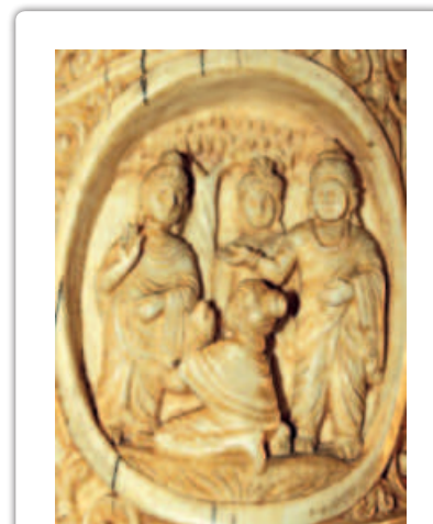
Ivory relief depicting Sāriputra and Maudgalyāyana becoming disciples of the Buddha

its existence is confirmed by references found in a Chinese translation of Sri Dharma-piṭaka-sampradāya Nidāna (472 AD), titled Fu ja tsang yin yüan ch'üan , and two other Buddhist liturgical texts. The plot was possibly based on the Raṭṭhapalasutta in the Majjhimanikāya , showing how Raṭṭhapala, after renouncing worldly life to become a monk, could not be enticed back to worldly life even with heaps of gold and alluring advances of his ex-wives. As recounted in Fu ja tsang yin yüan ch'üan , a performance of the play, in which Āsvaghōṣa himself