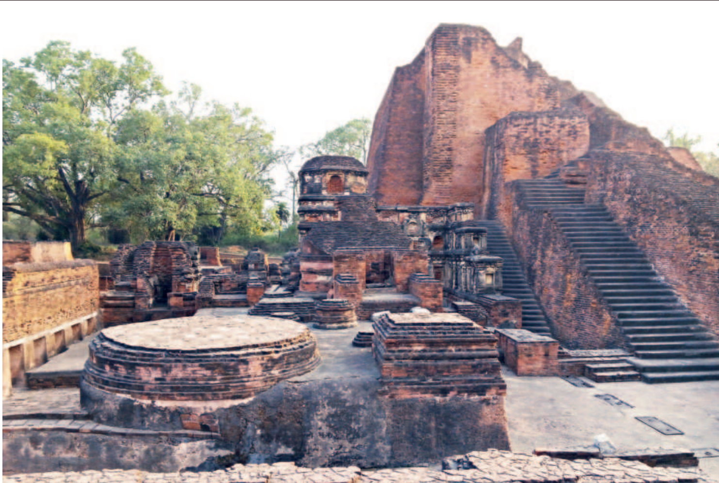
(L) A stupa dedicated to Sariputra at the ancient Nalanda monastery, Bihar, India. (R) Mahasiddha Chandragomin, Black Schist, Bangladesh, 12th century