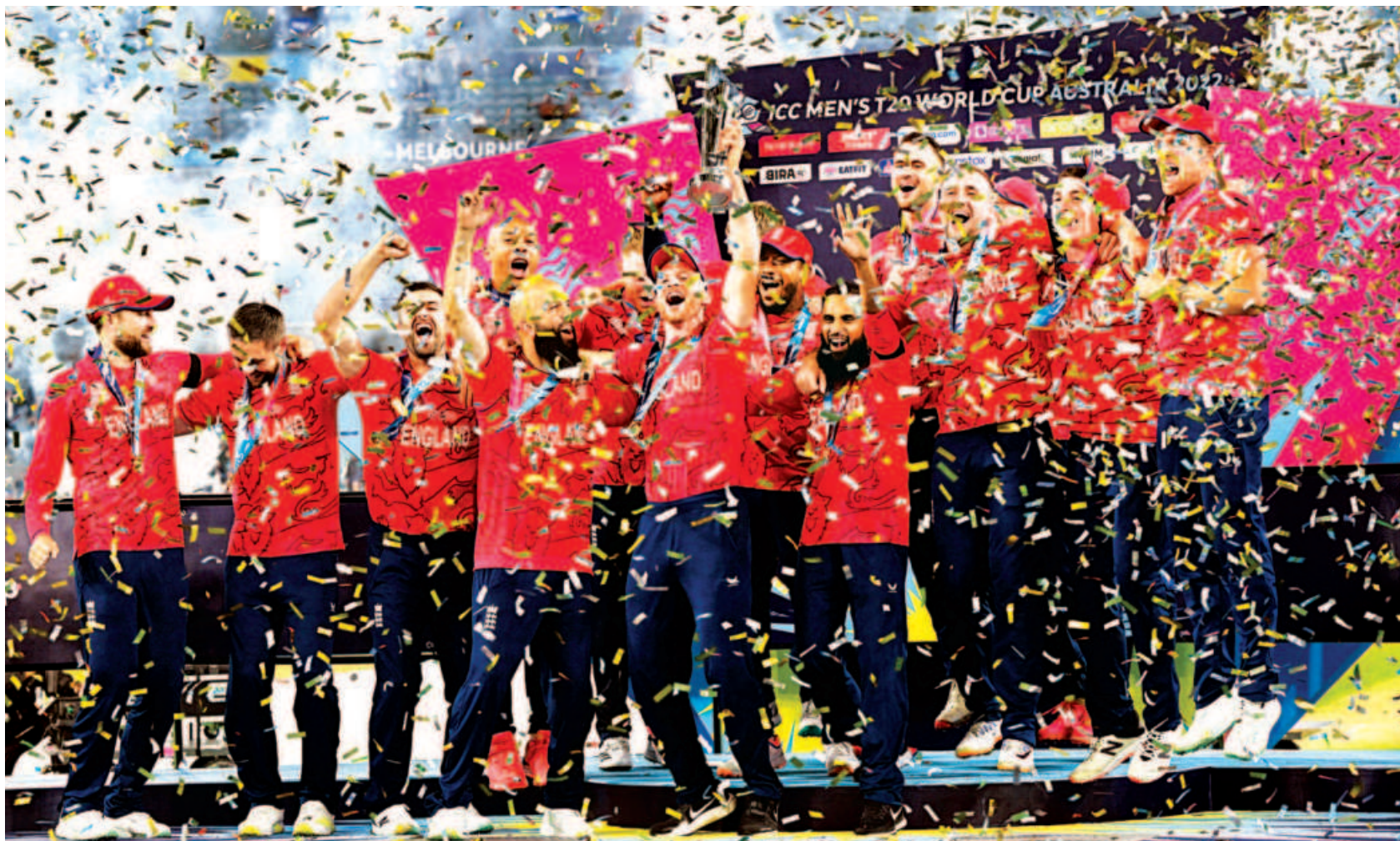
Thirty years after losing the 50-over World Cup final to Pakistan at the same venue, England turned the tables with brilliant death bowling and Ben Stokes' half-century in yesterday's T20 World Cup final at the Melbourne Cricket Ground. The inspired all-around effort saw England defeat Pakistan by five wickets to claim their second Twenty20 World Cup title.