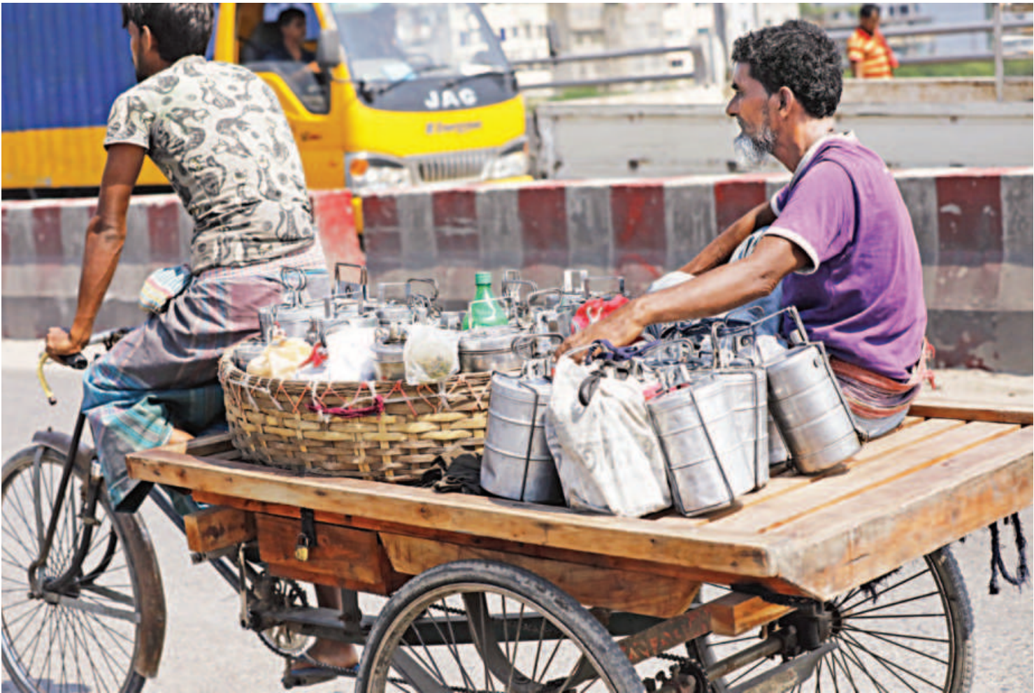
A man sits on a van holding onto multiple tiffin carriers, which will be distributed to service holders in the Motijheel area. The food is prepared in Keraniganj based on pre-orders and then supplied before lunch. This kind of lunch service is quite popular among regular office-goers, since they can get a full meal for just under Tk 100. The photo was taken near Babu Bazar Bridge recently.

UNB, Dhaka With six more deaths reported in 24 hours till yesterday morning, this year's fatalities from Dengue climbed to 199. During this period, 918 patients were hospitalised with the viral fever, according to the DGHS. Among the latest deaths, three were reported in Dhaka while one in Chattogram. Of the new patients, 530 were admitted to different hospitals in Dhaka. A total of 3,275 dengue patients are now receiving treatment at hospitals across the country. DGHS has recorded 47,670 dengue cases and 44,196 recoveries so far.