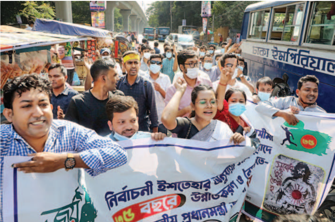
Youths under the banner of "Chakriprattashi Juba Prajanma" bring out a procession in the capital's Shahbagh area yesterday with a demand to raise the age limit to enter government jobs to 35 years.