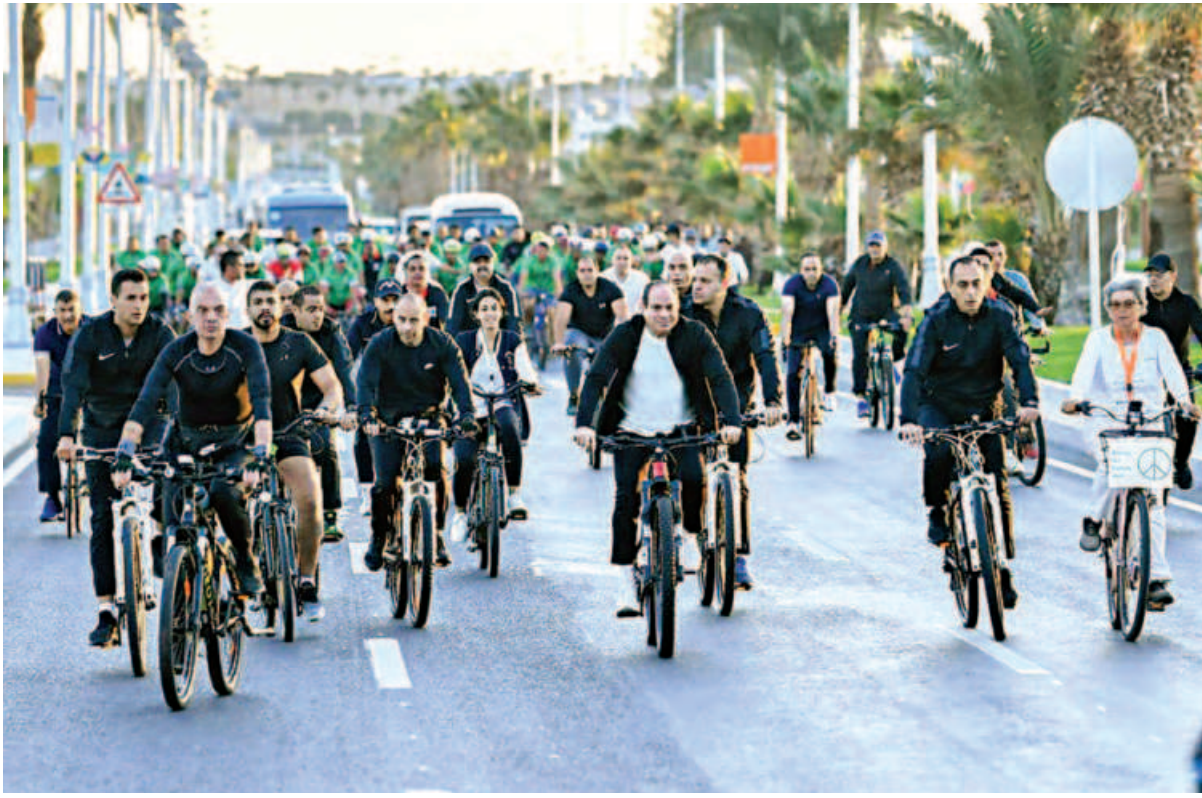
A handout picture released by the Egyptian Presidency's official Facebook yesterday shows Egyptian President Abdel Fattah el-Sisi (3rd R) riding a bicycle on the sidelines of the COP27 climate conference, in Egypt's Red Sea resort city of Sharm el-Sheikh.