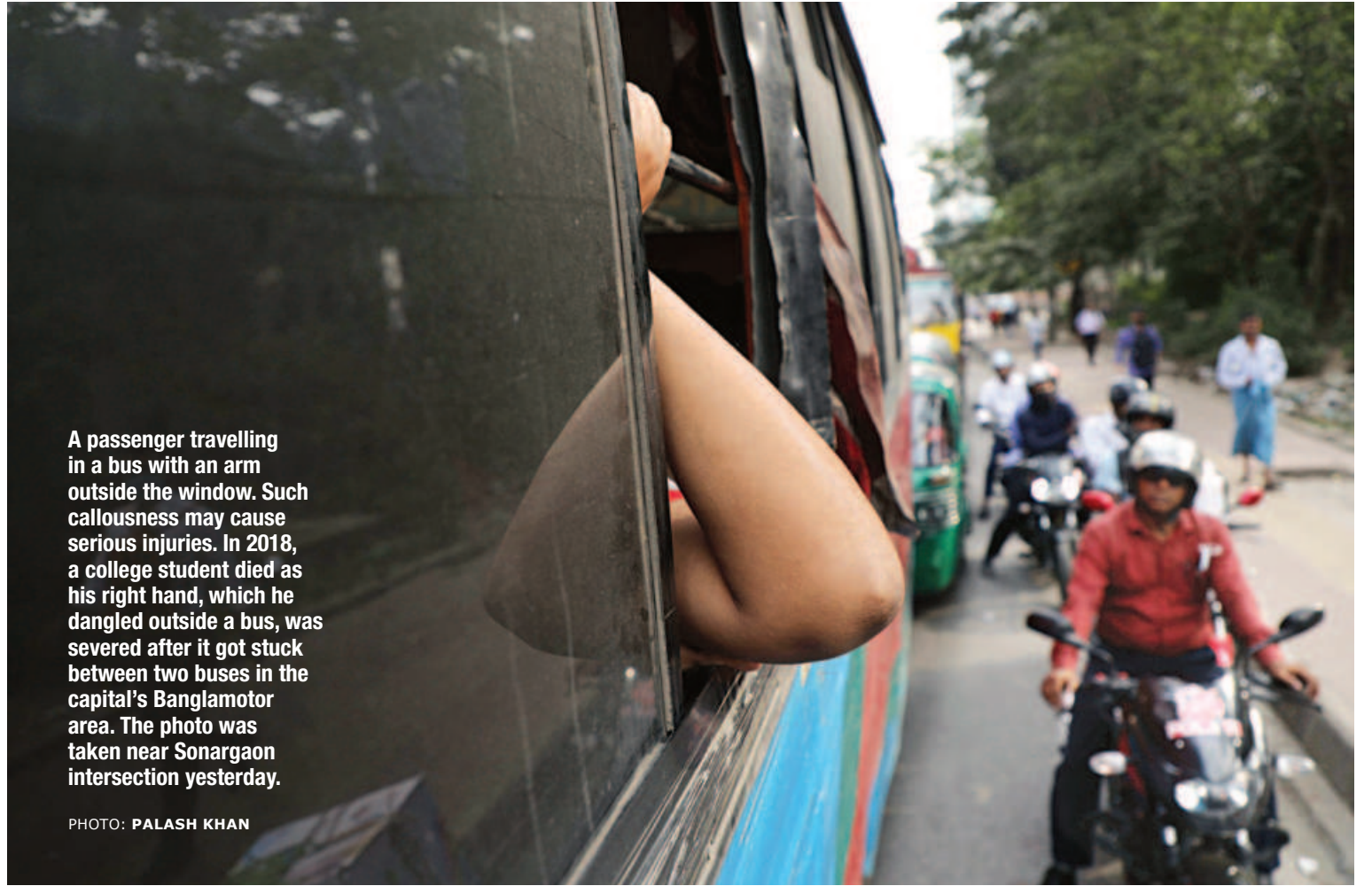
A passenger travelling in a bus with an arm outside the window. Such callousness may cause serious injuries. In 2018, a college student died as his right hand, which he dangled outside a bus, was severed after it got stuck between two buses in the capital's Banglamotor area. The photo was taken near Sonargaon intersection yesterday.