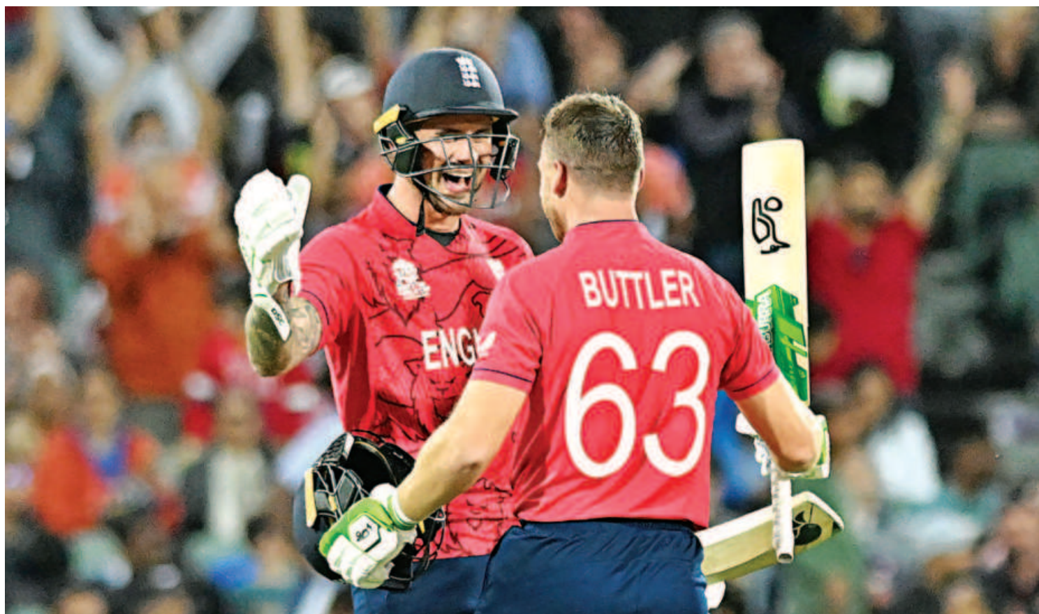
England captain Jos Buttler and Alex Hales celebrate as their record unbroken opening partnership helped humiliate India with 10-wicket defeat in the second semifinal of the ICC T20 World Cup at the Adelaide Oval yesterday. England set up a final against Pakistan on November 13 in Melbourne.