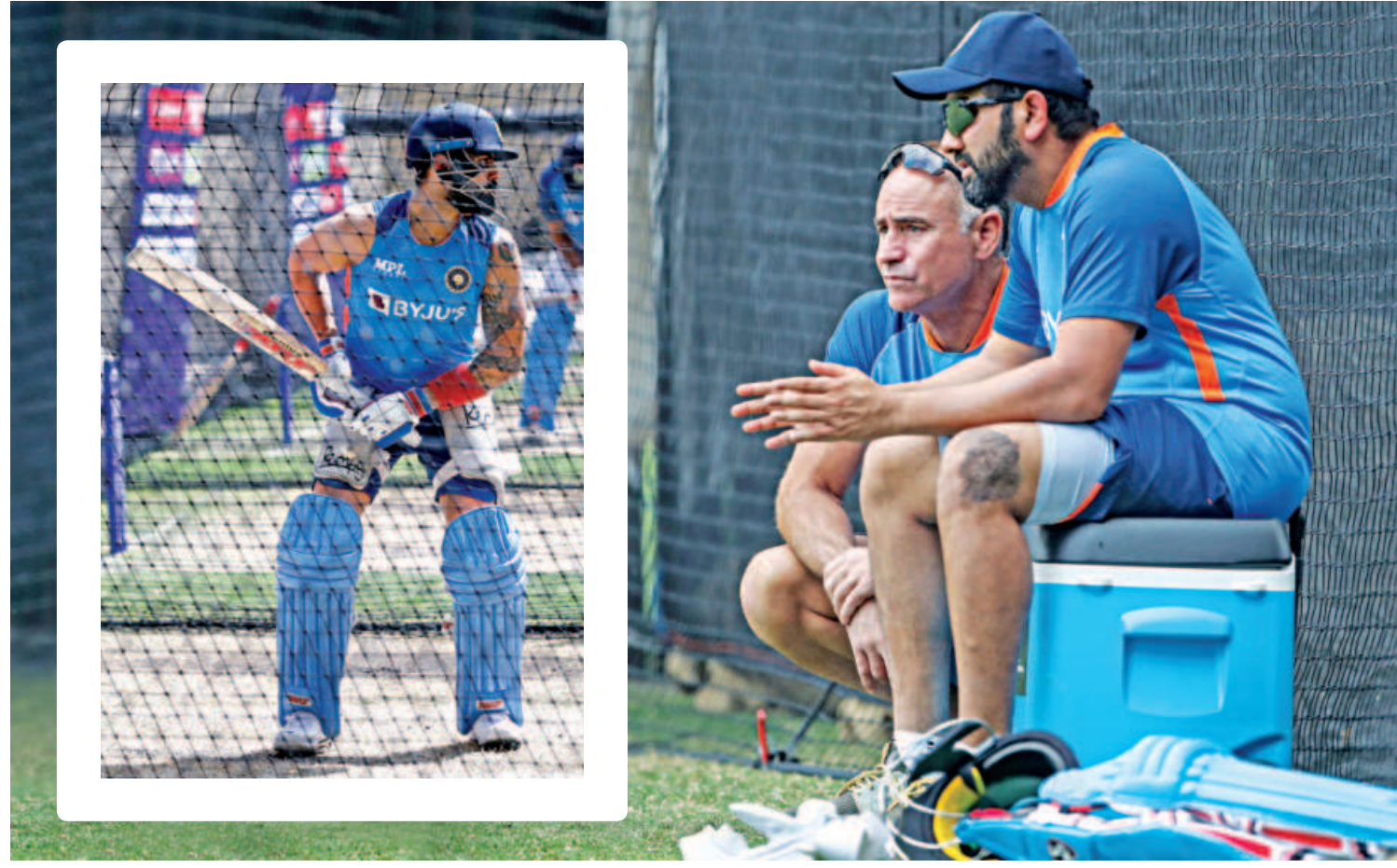
England will be wary of Indian batting firepower, especially with the form of Virat Kohli, and will want to counter that with a fiery pace attack, spearheaded by Mark Wood, in the second semifinal of the T20 World Cup in Adelaide today.

"Such up and down in form is part and parcel of the game, every player goes through such phases," Babar said