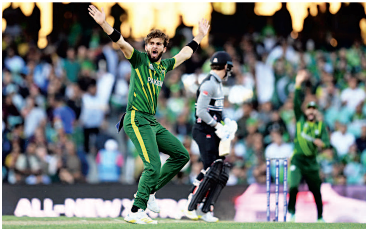
It was Pakistan pace spearhead Shaheen Shah Afridi who gave his side the early momentum, trapping in front New Zealand's explosive opener Finn Allen in the opening over in yesterday's T20 World Cup semifinal in Sydney.