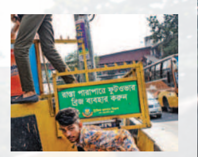
A woman squeezing her way through a gap in the central reservation at the Mohakhali intersection in the capital. To do so she has to duck beneath a DMP sign urging people to use the nearby footbridge. Inset, a young man is also seen doing the same. Pedestrians taking risks while crossing this busy thoroughfare, as well as others in the city, ignoring the safe option is a common sight. The photo was taken on Tuesday.