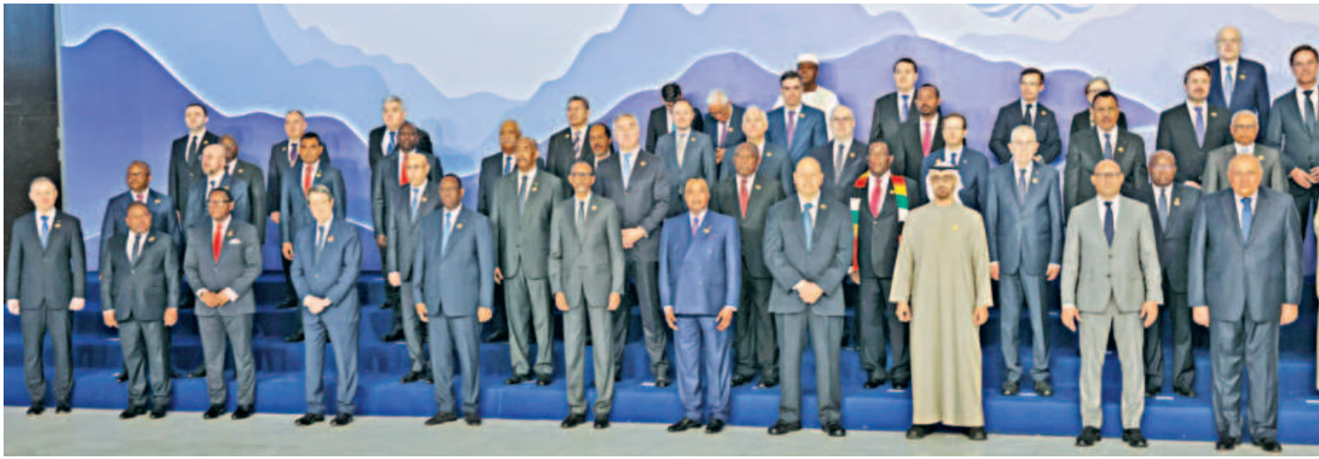
Participating world leaders stand for a commemorative group picture ahead of their summit at the COP27 climate conference, in Egypt's Red Sea resort city of Sharm el-Sheikh, yesterday.

Among the new sources of financing, Germany said it would double its financing for forests to 2 billion euros ($1.97 billion) through 2025.