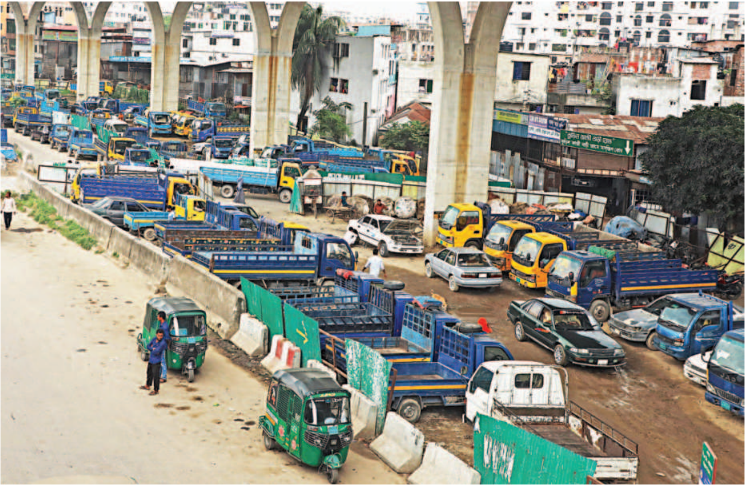
The road underneath Kuril flyover is completely barred from public use as it has been turned into an illegal parking space for pickup trucks and makeshift garages. Although this situation has persisted for quite some time now, authorities have done very little to free this road of these menace. This photo was taken recently.