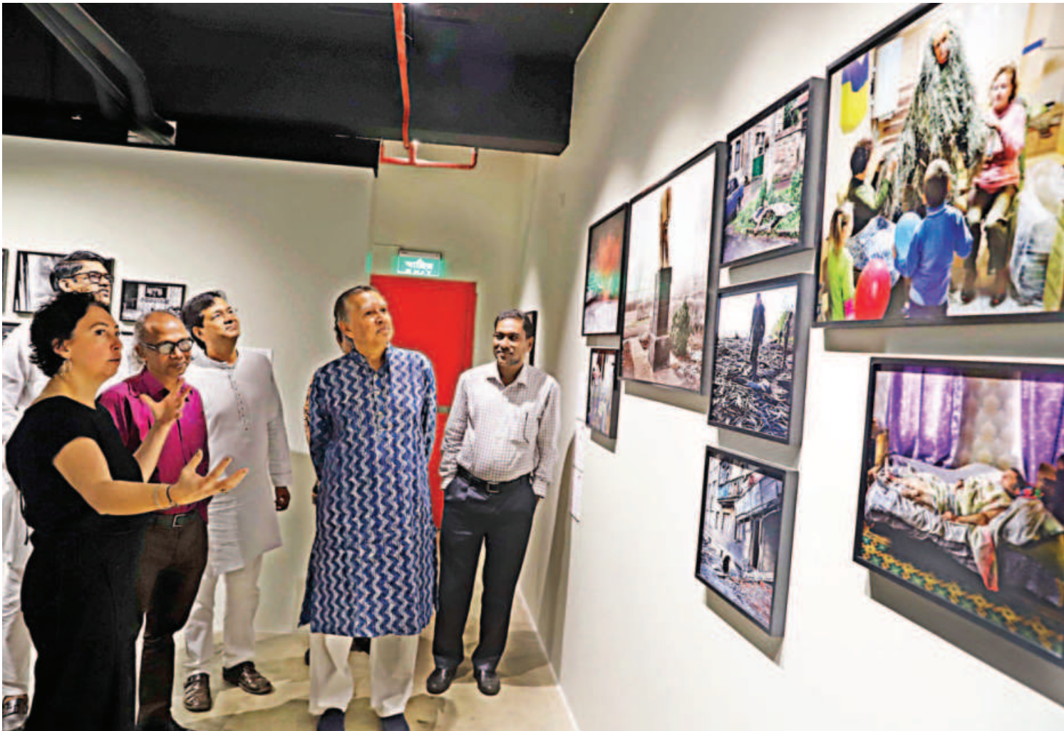
Spectators at the exhibition at the capital's Drik Bhobon. Moderated by Shahidul Alam, a discussion was also held as part of the World Press Photo Exhibition-2022. Hosted by Drik, the exhibition started on Friday and will continue till November 21.