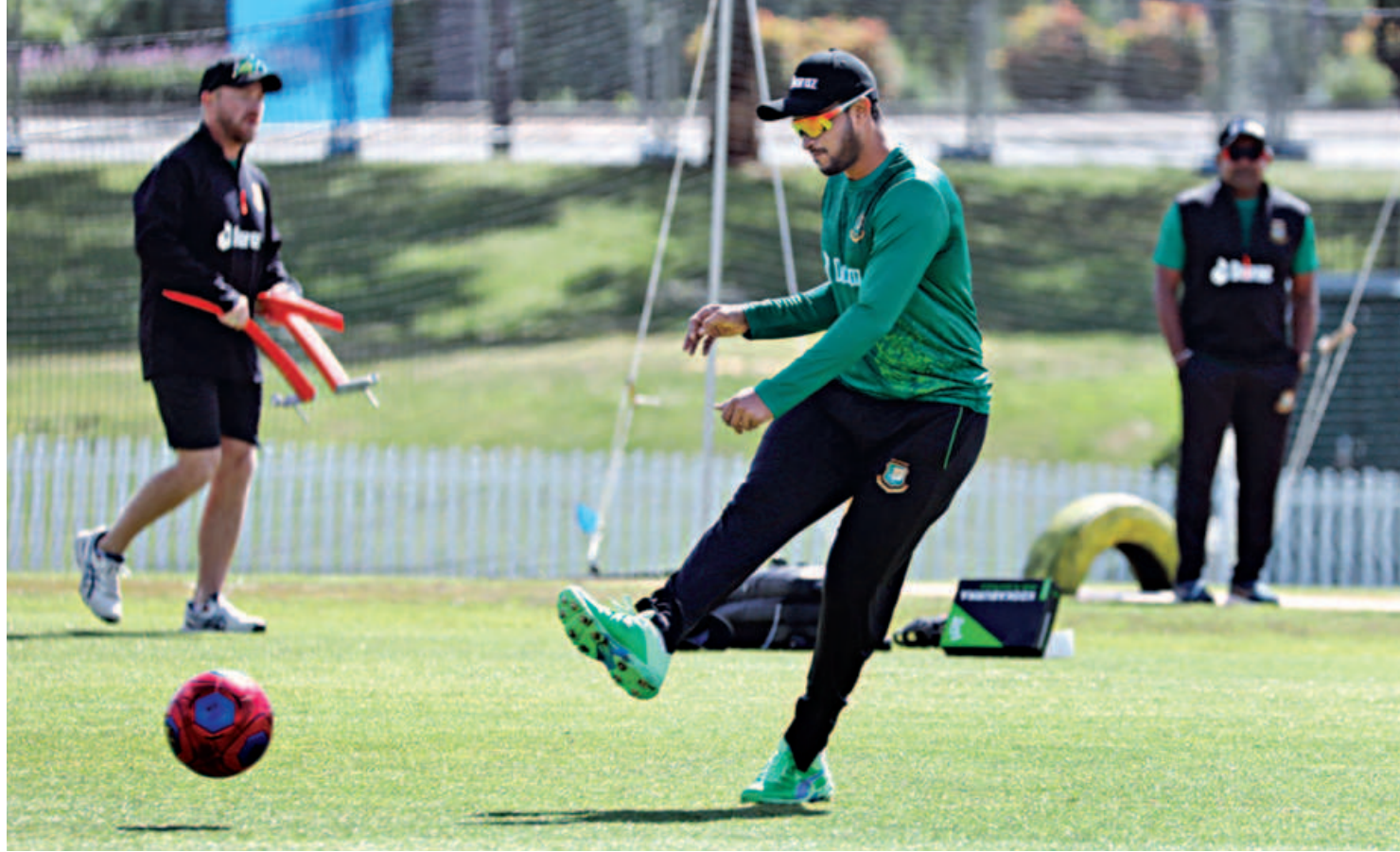
Skipper Shakib Al Hasan was trying out his football skills during Bangladesh's practice session on Friday ahead of their final and must-win T20 World Cup Super 12 fixture against Pakistan tomorrow. [Bottom] Meanwhile, in-form pacer Taskin Ahmed talks with the media present in Adelaide.

New Zealand vs Ireland New Zealand: 185-6 in 20 overs (Williamson 61, Allen 32; Little 3-32, Delany 2-30) Ireland: 150-9 in 20 overs (Stirling 37, Balbirnie 30; Ferguson 3-22, Santner 2-26) Result: NZ won by 35 runs Player-of-the-match: Kane Williamson Australia vs Afghanistan Australia: 168-8 in 20 overs (Maxwell 54 not out, Marsh 45; Naveen 3-21, Ferooqi 2-29) Afghanistan: 164-7 in 20 overs (Rashid 48 not out, Gulbadin 39; Zampa (2-22) Result: Australia won by four runs Player-of-the-match: Glenn Maxwell