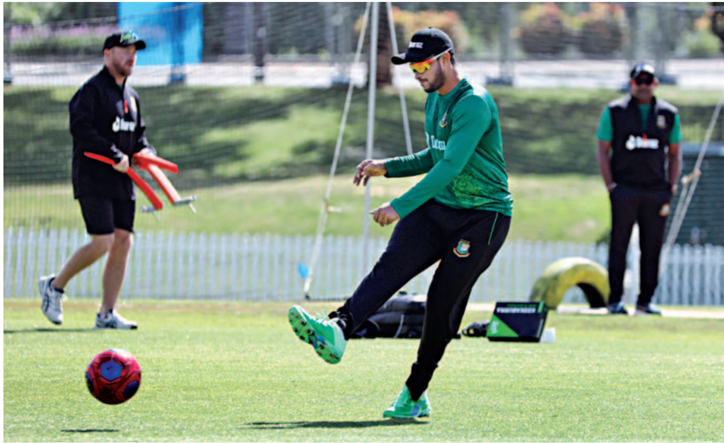
Skipper Shakib Al Hasan was trying out his football skills during Bangladesh's practice session on Friday ahead of their final and must-win T20 World Cup Super 12 fixture against Pakistan tomorrow. [Bottom] Meanwhile, in-form pacer Taskin Ahmed talks with the media present in Adelaide.

New Zealand vs Ireland New Zealand: 185-6 in 20 overs (Williamson 61, Allen 32; Little 3-32, Delany 2-30) Ireland: 150-9 in 20 overs (Stirling 37, Balbirnie 30; Ferguson 3-22, Santner 2-26) Result: NZ won by 35 runs Player-of-the-match: Kane Williamson Australia vs Afghanistan Australia: 168-8 in 20 overs (Maxwell 54 not out, Marsh 45; Naveen 3-21, Ferooqi 2-29) Afghanistan: 164-7 in 20 overs (Rashid 48 not out, Gulbadin 39; Zampa (2-22) Result: Australia won by four runs Player-of-the-match: Glenn Maxwell