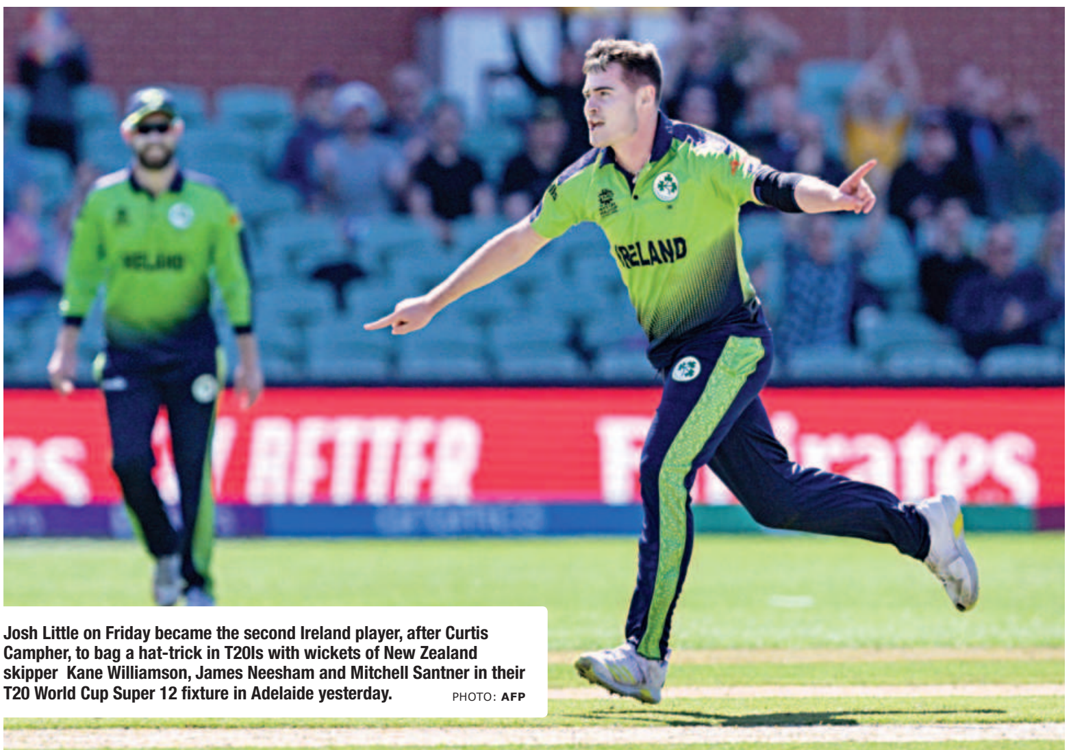
Josh Little on Friday became the second Ireland player, after Curtis Campher, to bag a hat-trick in T20Is with wickets of New Zealand skipper Kane Williamson, James Neesham and Mitchell Santner in their T20 World Cup Super 12 fixture in Adelaide yesterday.

Left-armed Little had captain Williamson caught for 61, then trapped both James Neesham and Mitchell Santner lbw for no score in the 19th over to bring up Ireland's second hat-trick in T20 internationals.