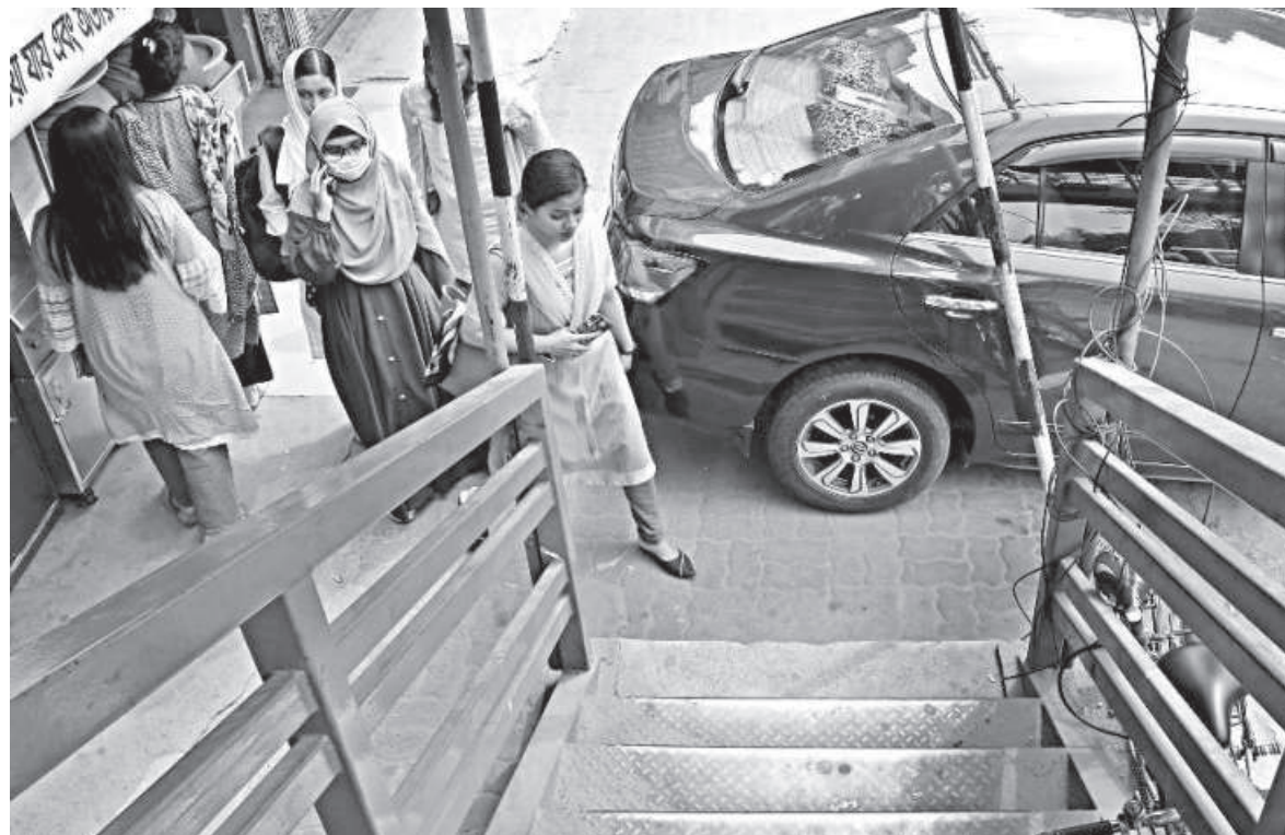
Pedestrians face difficulty in using the footbridge as vehicles have been parked right at the mouth of the bridge, obstructing their movement. As authorities do not intervene, these private cars get away with parking without permit. This photo was taken on Dhaka's Mirpur Road in Kalabagan area recently.