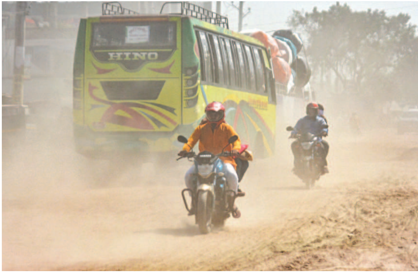
Dust and dirt fill the air as vehicles ply a road in Khulna's Zero Point area. The lack of tarmacked roads in many districts has been worsening the air pollution of the country. With our air quality falling sharply every year, people have been suffering from many pollution-related illnesses such as allergies and respiratory diseases. The photo was taken yesterday.

This practice gives a negative message to officials of other cadres, said an official of the Department of Agricultural Extension.