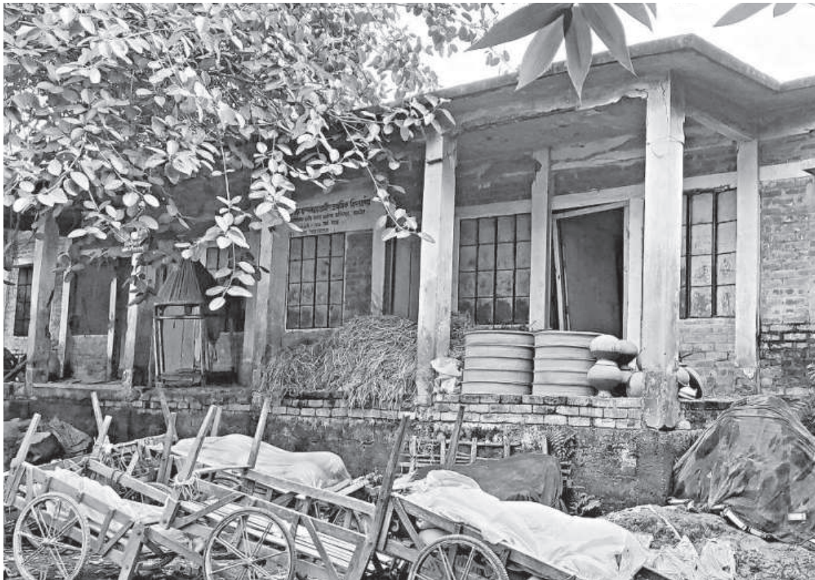
This ghostly building is officially registered as a community school. As 15 such schools of Tangail have remained locked for over two decades, weeds and bushes have taken over the buildings. This photo was taken recently from Tangail's Basail upazila.