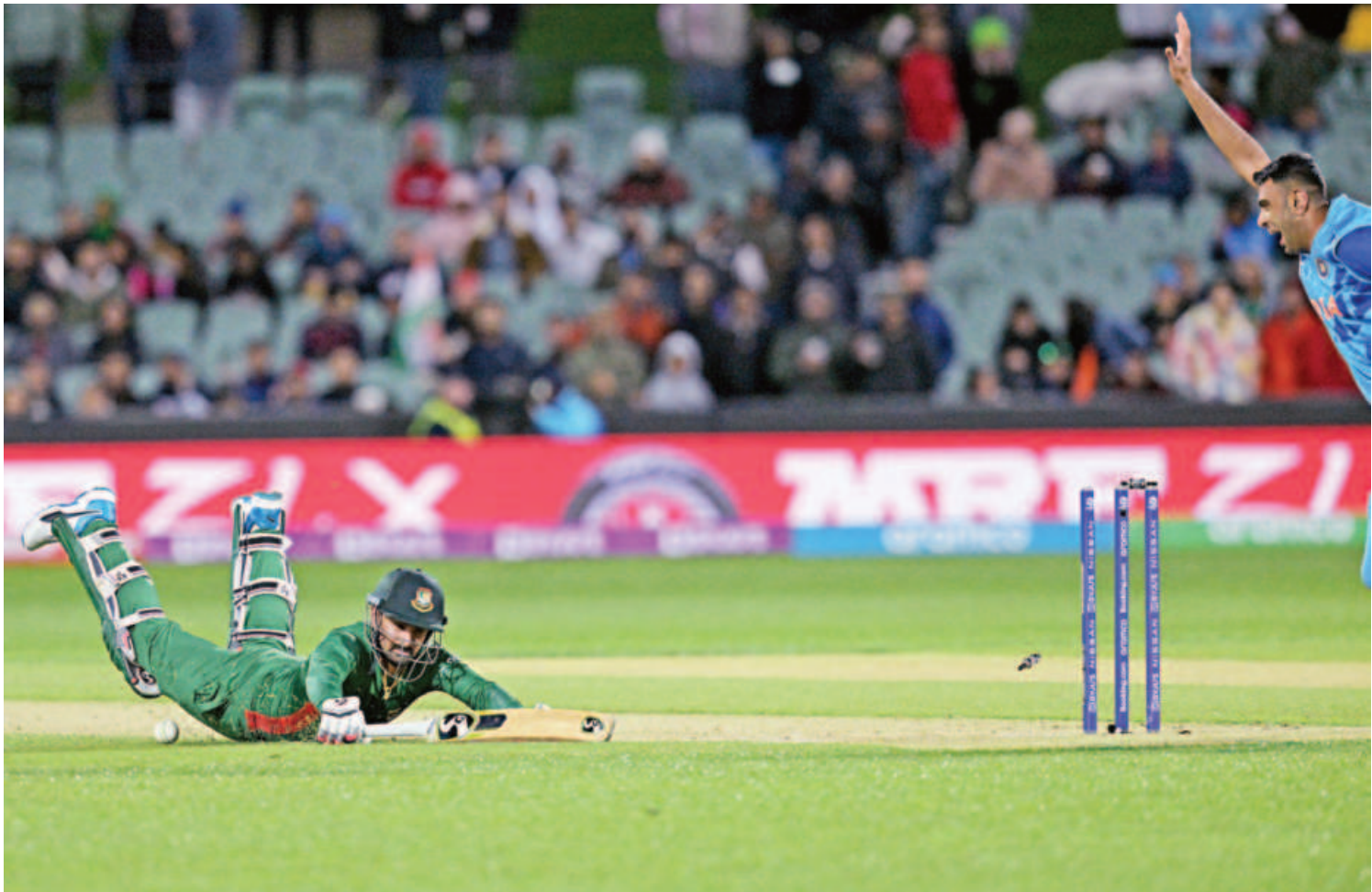
It needed a direct hit from the deep to dismiss Liton Das, who gave Bangladesh a rollicking start with a 27-ball 60. Liton's dismissal, though, saw the chase lose steam as the Tigers eventually suffered a five-run defeat (D/L) against India in their T20 World Cup Super 12 clash in Adelaide yesterday.