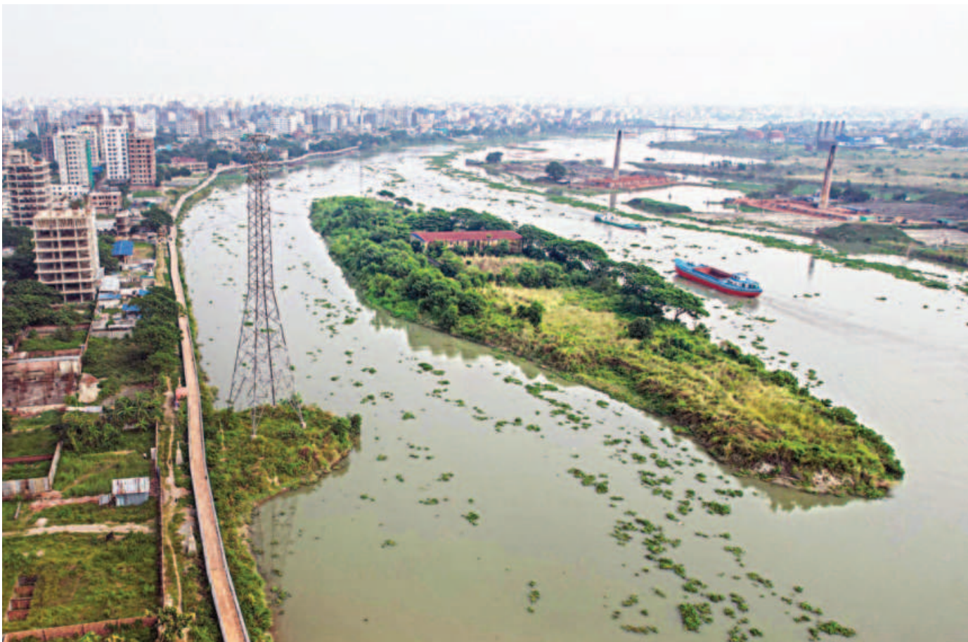
In the absence of adequate dredging, sedimentation formed this island in the middle of the Turag in Bosila area of the capital. But encroachers have already built structures on it. The photo was taken yesterday.