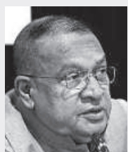
Mir Mushtaq Ahmed Robi, Member of the Parliament, Satkhira-2

Instead of depending on others, we should find innovative solutions to our local problems based on our indigenous knowledge and expertise. Last but not least, we need to make people aware of the risks of climate-related disasters and enhance disaster preparedness to reduce the loss and damage from climate change.